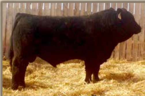
MRL Prowler 165B