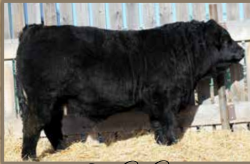
TSZ Columbo 923C