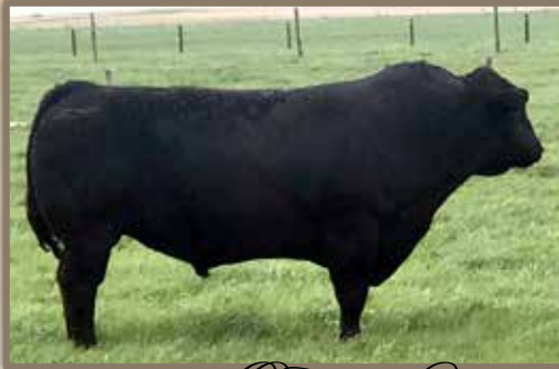
TSZ Full Merrit 637Z