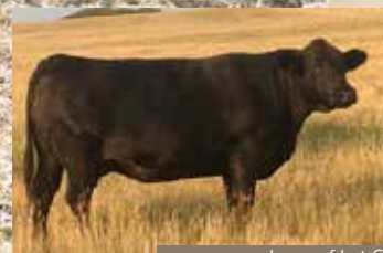
dam of lot 6