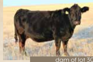
dam of lot 30

RANK CE BW MCE REA FAT MRB API % EPD 40% 25% 4% 40% 15% 30% 30%