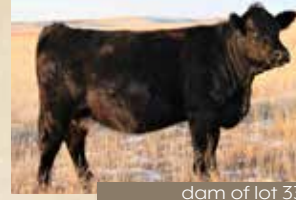
dam of lot 33

RANK CE BW WW YW MCE REA MRB API TI % EPD 10% 15% 50% 50% 5% 40% 25% 10% 15%