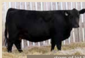
dam of lot 8

8 TSZ Back In Black 206E BLACK/POLLED 1207219 /// HTW 206E /// FEB 18, 2017 /// BW-84 /// WW-713