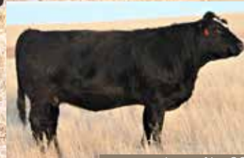
dam of lot 26