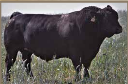
TVF Advance 50A