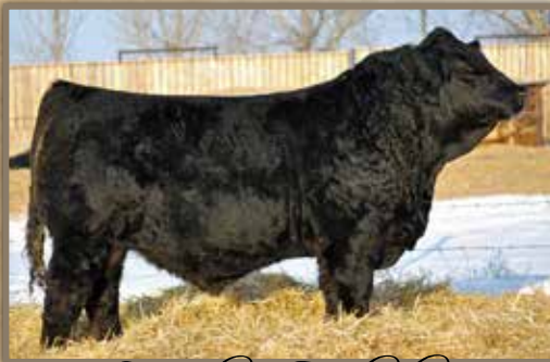
RF Captain Black 430B