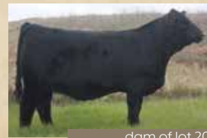
dam of lot 20

RANK CE BW MCE REA MRB API TI % EPD 25% 20% 10% 5% 45% 25% 50%