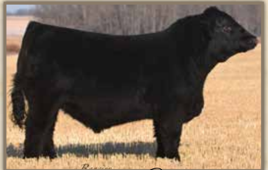
NCB Cobra 47Y