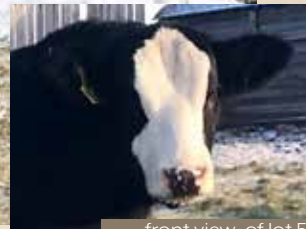
front view of lot 5