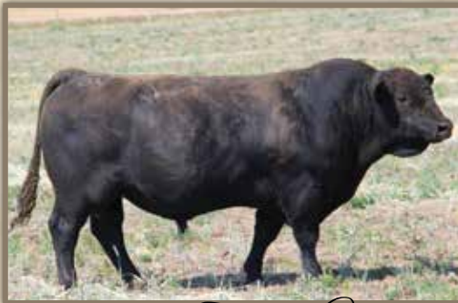
LAZYCREEK Moonshine 75A