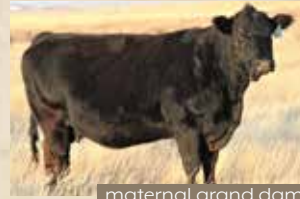
maternal grand dam

RANK CE BW MCE REA MRB API TI % EPD 5% 5% 10% 45% 10% 2% 20%