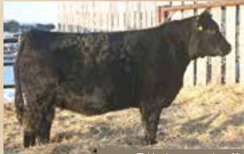
3/4 sister to lot 11