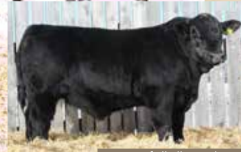
full sib to dam