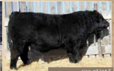
sire of lot 5