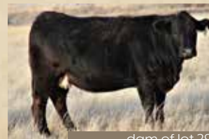
dam of lot 29

RANK WW YW CW REA FAT % EPD 45% 50% 45% 10% 25%