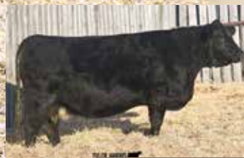
maternal grand dam