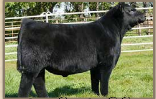
JF Back In Black 406B