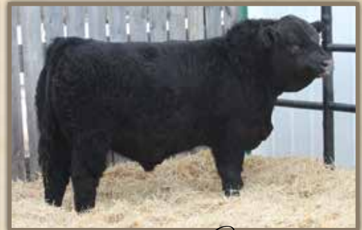
TSZ Presto 847B