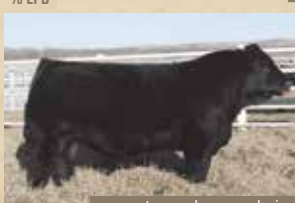
maternal grand sire

25 TSL Presto 262E BLACK/POLLED 1208912 /// HTW 262E /// MAR 20, 2017 /// BW-85 /// WW-776