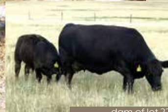
dam of lot 22

- One of the top bulls we have on offer - He's good in every way and needs serious consideration - Dam was high selling bred heifer a few years ago at Kopps dispersal and is as consistent of a producer as any. Maybe her best yet - Brothers sold to Bircham Ranch of Piapot, SK and Anchor D Ranch, Oyen AB. - Homo Polled/Color Coat tests pending