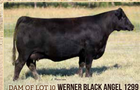
DAM OF LOT 10 WERNER BLACK ANGEL 1299

DAMERON FIRST CLASS COLBURN PRIMO 5153 OSF SILVEIRAS SARAS DREAM 1339