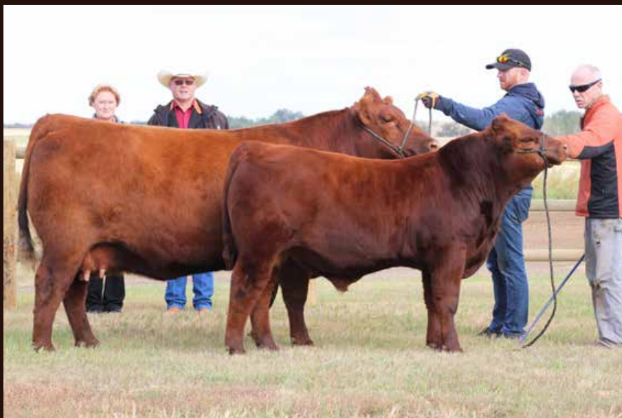
Red Wheel Annie Oakley 8B & Red Wheel Bar-E-L Patriot 60F Summer 2018

We are proud that Annie Oakley carries our prefix, and that her sire and dam were bred, born and raised here. Thank you to Bar-E-L Angus for being great partners on this outstanding pair!