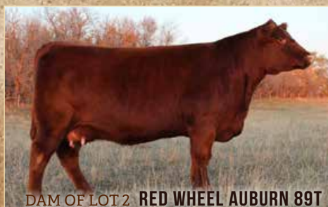
DAM OF LOT 2 RED WHEEL AUBURN 89T