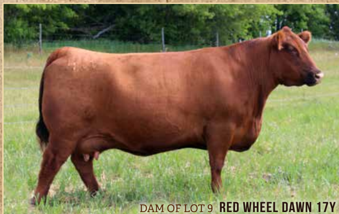
DAM OF LOT 9 RED WHEEL DAWN 17Y