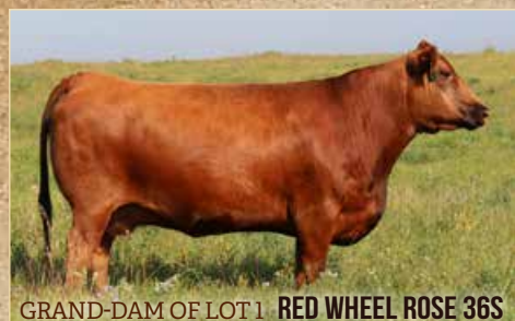
GRAND-DAM OF LOT 1 RED WHEEL ROSE 36S

Structurally Sound | Good Footed | ET Donor Dam