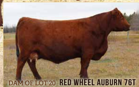
DAM OF LOT 20 RED WHEEL AUBURN 76T

ET REG# 2061019 TATTOO MFW 90F BIRTHDATE FEBRUARY 05 2018