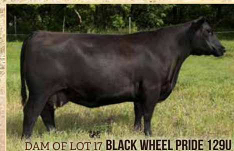
DAM OF LOT 17 BLACK WHEEL PRIDE 129U