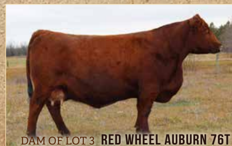
DAM OF LOT 3 RED WHEEL AUBURN 76T