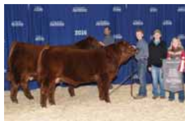
Dam of Lot 3 ANCHOR B BAILEY 21B