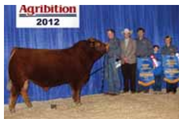
Sire of Lots 15, 16 NAME NAME NAME NAME