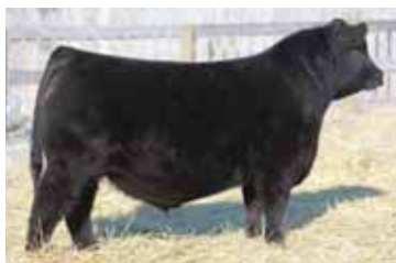
Sire of Lot 29 BROOKING TRENDSPOTTER 6166