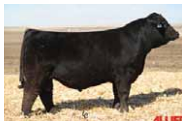
Sire of Lots 39 & 40 CCR COWBOY CUT 5048Z