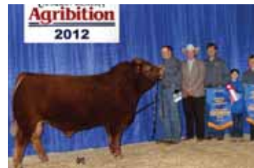
Maternal Grandsire of lot 21, 22, 24 ANCHOR B "THE BOSS"