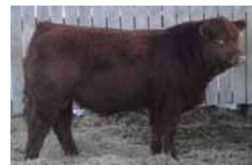
Maternal Brother of Lot 4 ANCHOR B CHARLSTON 50C