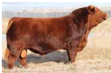
Sire of Lots 23, 24, 25 HUNT CREDENTIALS 37C

» This heifer will be able to compete at the CJLA Impact 2019.