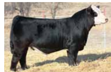
Sire of Lot 38 W/C LOADED UP 1119Y