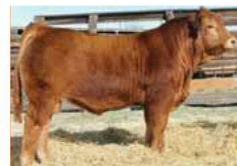
Maternal Grandsire of Lot 8 WULFS AMAZING BULL T341A