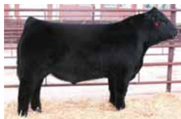
Sire of Lot 13 COLE ARCHITECT 08A