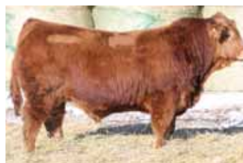
Full sib to dam of Lot 8 JBH 20E SOLD TO COCHRANE FARMS