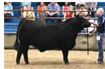
Maternal Sib to Lot 42 GRAND CHAMION STEER AT PRAIRIELAND AG SHOWCASE