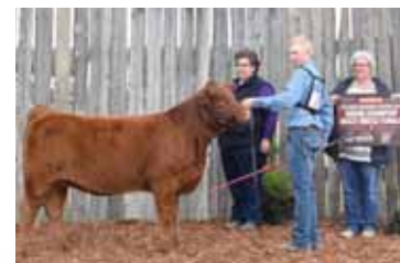
2018 Young Ranchmans, SC HUNT CREDENTIALS X ANCHOR B BAILEY