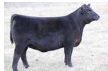
Maternal Sister to Lot 34 ANCHORAGE BLACKBIRD 8019