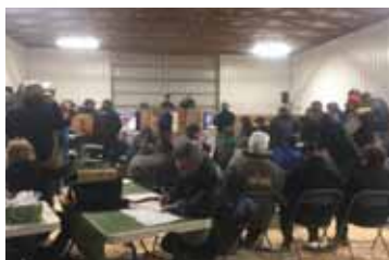
2018 Anchor B/Anchorage Bull Sale