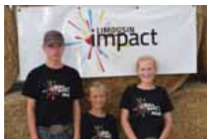
» 2018 CJLA Show Fun in Nova Scotia