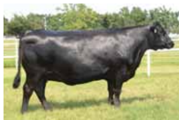
Dam of Lot 30 PF 7229 LUCY 2555