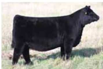
$30,000 Maternal Sister to Lot 27 BROOKING BLACK ANGEL 6017