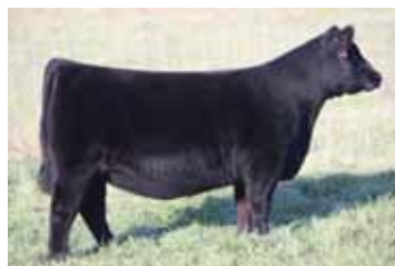
Dam of Lot 38 COME AS U R LADY 508C