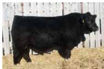
Sire of Lots 42 - 44 SVS COMPAS 511C