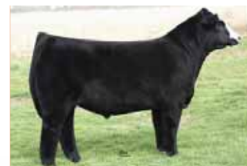
Maternal Sib of Lots 39 & 40 SVF STAR POWER S802