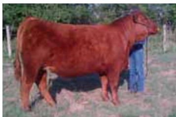
Maternal sister to Lot 17 ANCHOR B BAILEY