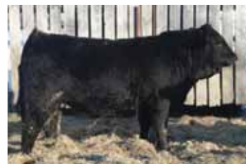
Maternal brother of Lot 20 ANCHOR B CLEVELAND 44C