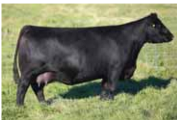
Grandam of Lot 29 S00 LINE ANNIE K 9165