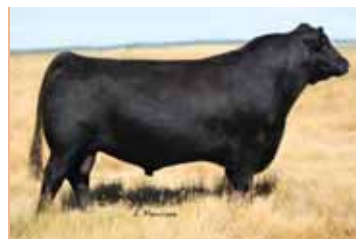
Sire of Lot 34 S00 LINE MOTIVE 9016