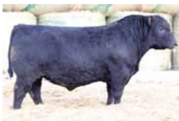
Paternal Brother of Lot 31 ANCHORAGE EASTWOOD 6196