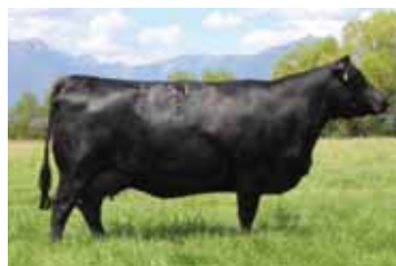
Dam of Lot 28 COLEMAN DONNA 1223