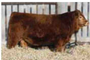
Full brother of dam of lot 21 ANCHOR B ALABAMA 8A SOLD TO TOTH FARMS