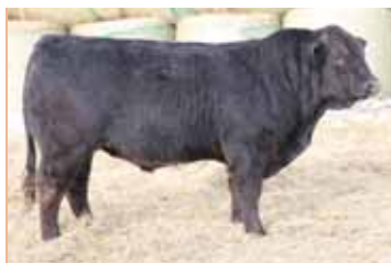
Sire of Lot 9, 10, 11, 12 NYK Designer 100