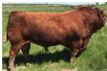
Sire of Lots 17, 18, 19 RCN BOJANGLES