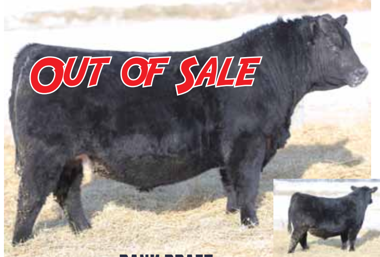
Lot 28 Anchorage BANK DRAFT 8140 // Angus