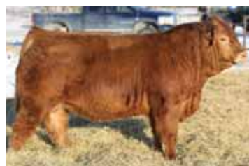
Maternal Brother of Lot 4 ANCHOR B EVAN 61E