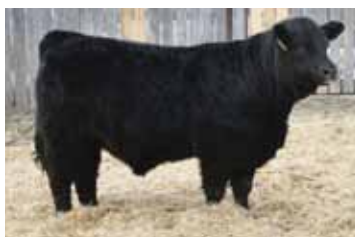
Maternal brother ANCHOR B DRAMBUIE 22D