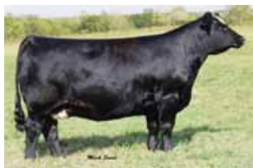
Dam of Lot 37 AJE/JF ANT JOYS ELEGANCE