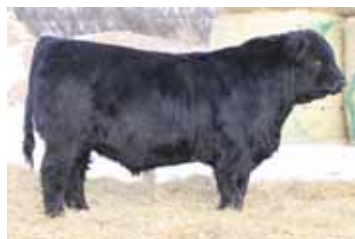
Maternal brother of Lot 10 ANCHOR B EDWIN 62E