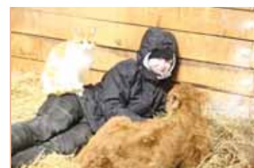
Taking a break