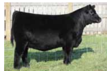
Maternal Sib of Lot 34 BROOKING BLACK ANGEL 6024