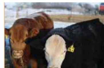
OUT OF THE SALON AND READY FOR PHOTOS