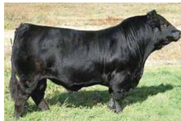
Sire of Lot 14 RPY PAYNES DERBY 46Z