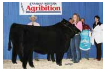
Grandam of Lot 12 RPY PERFECT STORM 10R

Angus Extra-Age Bulls :: SimAngus Yearling Bulls :: Simmental Yearling Bulls :: SimAngus Extra-Age Bulls