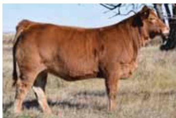
Daughter of granddam ANCHOR B FLORA 91F