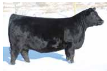
$23,000 Maternal Sister to Lot 28 COLEMAN DONNA 6205