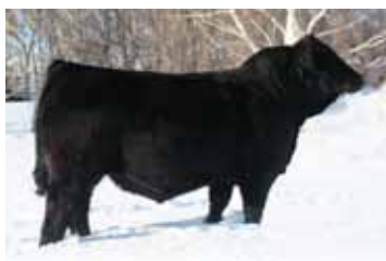
Grandsire of Lots 42-44 SVS CAPTAIN MORGAN 11Z