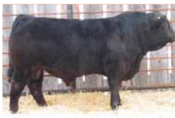
Grandsire of Lot 12 RICHMOND SLUGGER SRD 42S