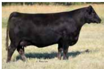
Dam of Lot 27 WERNER BLACK ANGEL 1299