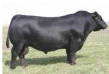
Sire of Lot 44 S A V NET WORTH 4200