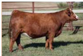
Dam of Lot 41 RUST SCREAM 6105D