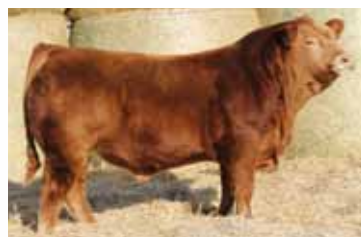
Sire of Lots 1 - 7 B BAR AUSTIN HEALY 4D ET