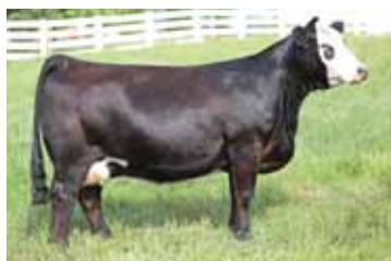
Dam of Lot 35 CRN MOLLYDOOKER 34C