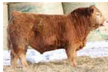
Full brother of dam of Lot 24 ANCHOR B EASTWOOD SOLD TO GRANT MILLER

» Another pedigree with longevity built in. She will compete in the showing & develop to be a front pasture female.