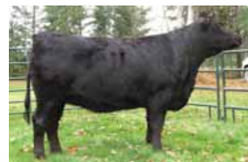
Dam of Lot 14 PINNACLE'S LF ASTER 1301A

Limousin Yearling Bulls :: Limousin Extra-Age Bulls :: Limousin Open Heifers :: Angus Yearling Bulls :: Ang