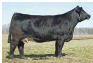
Grandam of Lots 39 & 40 SVF SHEZA STAR N902