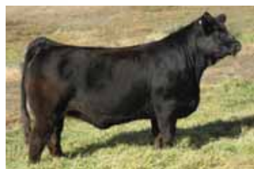
Dam of Lot 25 RPY PAYNES DIXIE 55D