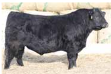
Maternal Brother of Lot 11 ANCHOR B DALTON 65D