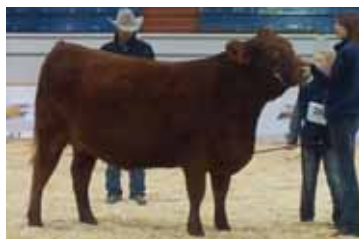
Dam of Lot 17 ANCHOR B ZAHARA