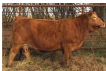
Dam of Lot 16 HIWAYS UNBELIEVABLE