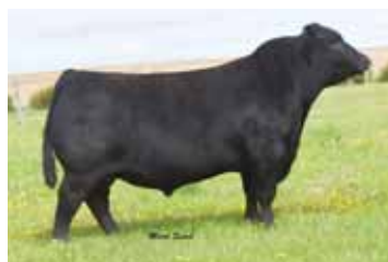
Sire of Lot 32 STYLES CASH R400