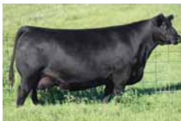
Grandam of Lot 33 EA ROSE 918