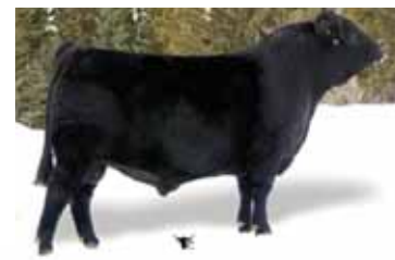
Gransire of Lot 10 TMCK DURHAM WHEAT 6030X