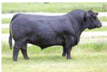
Sire of Lot 35 NCB COBRA 47Y