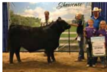
Maternal Sib to Lot 42 GRAND CHAMION STEER AT PRAIRIELAND AG SHOWCASE