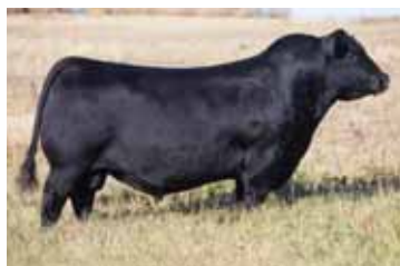
Sire of Lot 33 BROOKING BANK NOTE 4040