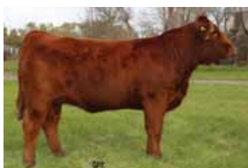
Dam of Lot 15 CAM POLL AMARYLLIS