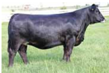
$40,000 Maternal Sib to Lot 37 CD JOYS ELEGANCE 6107