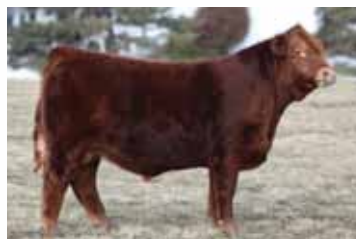
Sire of Lot 20 KOYLE APACHE 8A