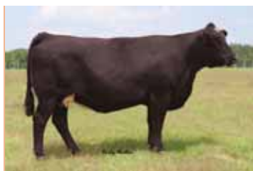
Dam of Lots 39 & 40 SFV/CLRWTR SHEZA STAR