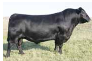
Sire of Lot 30 S A V 004 DENSITY 4336