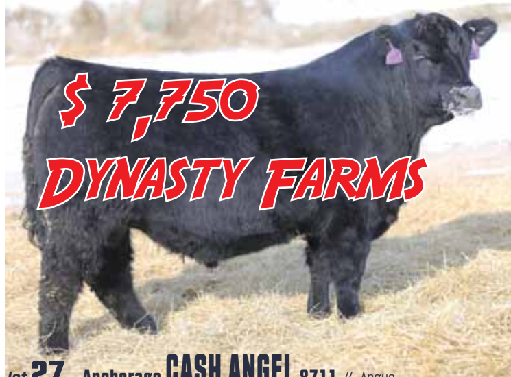
Lot 27 Anchorage CASH ANGEL 8711 // Angus