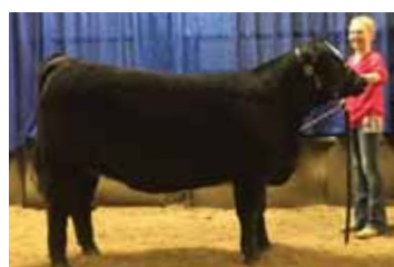
Dam of Lot 36 Anchorage Delight 6045