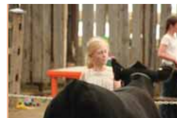
Full sib to Delight - Reserve Grand Champion at Summer Synergy