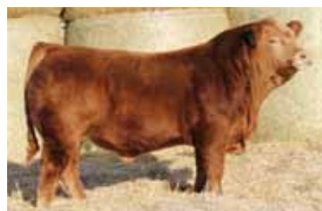
Sire of Lots 21 & 22 B BAR AUSTIN HEALY 4D ET