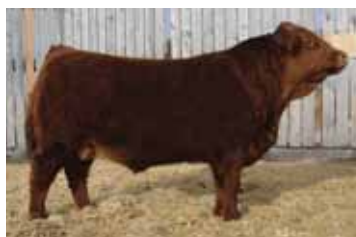
Maternal Brother of Lot 3 ANCHOR B DONALDSON 34D