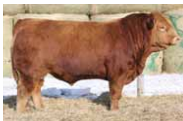
Maternal Brother of Lot 7 ANCHOR B DENVER 30D