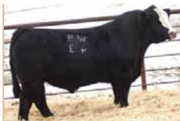
Sire of Lot 41 W/C CASH IN 43B