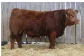
Full brother of Lot 9 ANCHOR B BENTLEY 4B