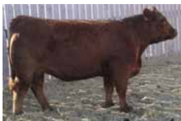
Full sister to dam of Lot 7 JBH 23B SOLD TO B BAR CATTLE CO.