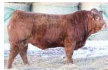
Full brother of dam of Lot 22 ANCHOR B ENDER 10GE SOLD TO MARTENS LIVESTOCK