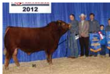
Maternal Grandsire of Lot 2 ANCHOR B "THE BOSS"