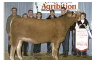
Maternal Grandam of Lot 2 ANCHOR B POLL KARI 4K