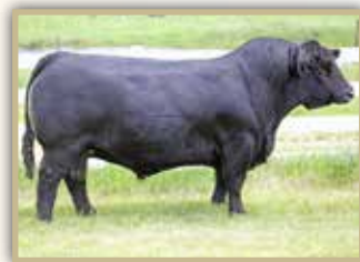
Service Sire / NCB Cobra 47Y

REMINGTON LOCK N LOAD 54U S: W/C LOADED UP 1119Y AUBREYS BLACK BLAZE III JF MILESTONE 999W D: HPF CREAM SODA Y010 IC CREAM SODA R56