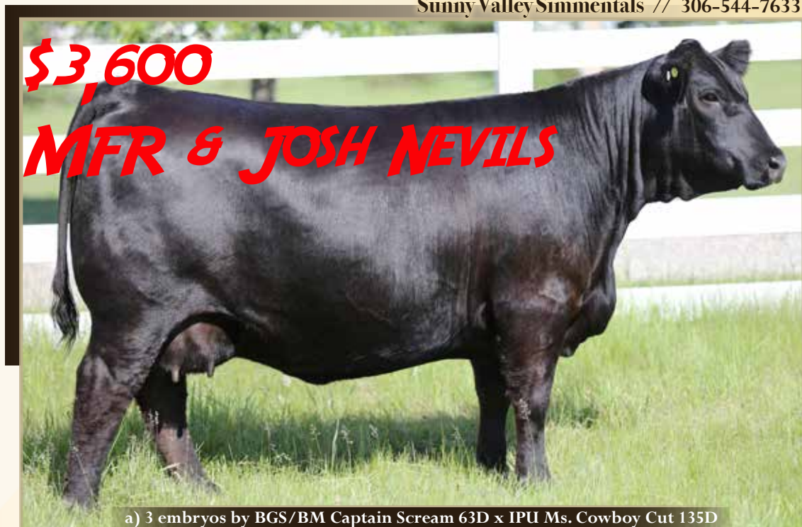
a) 3 embryos by BGS/BM Captain Scream 63D x IPU Ms. Cowboy Cut 135D

CCR COWBOY CUT 5048Z IPU MS. COWBOY CUT 135D IPU MS. TULA 19B