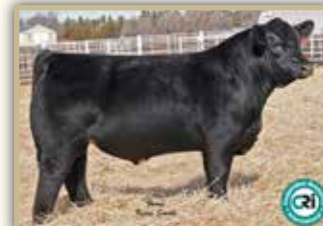
Sire / W/C WideTrack 694Y

ce 9.6 bw 3.3 ww 71.2 yw 111.1 mce 1.1 mww 50.2 milk 14.6 api 133.66 ti 70.68