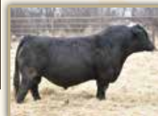
LCDR Witness 541C Sire of 1C