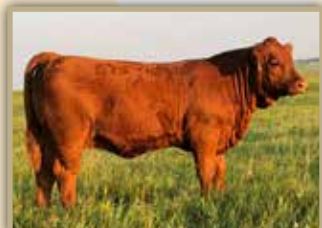
Paternal Sib /DGS 12G

ce 6.5 bw 3.1 ww 65.1 yw 97.5 mce 5.3 mww 57.7 milk 25.1 api 118.81 ti 64.26