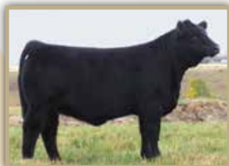
Mat. Sib / CMS 717E

This year was our first calf crop off the LFE Night Hawk 3013D bull and we were impressed with the calving ease and growth of his calves. All the calves off of him were born unassisted and we have kept them all in either the bull or replacement heifer pen and we are excited to see them develop, including this heifer we are offering. 912G has tremendous depth of body and a striking profile that will catch your eye every time. One of her greatest features is the way she transitions from her fore rib, through her smooth shoulders and up into a beautiful head. She's a feminine, stylish heifer that is structurally sound and would be a great addition to your herd!