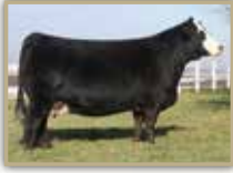
$60,000(US) full sib to Ava GVC Black Star 307Y