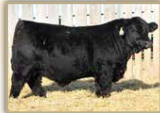
Sire / MRL Missile 138C

COME AS U R RED ROCKET S: MRL MISSILE 138C MRL MISS 2423Z DRAKE POKER FACE 2X D: CMS SODA POP 412B HPF CREAM SODAY010