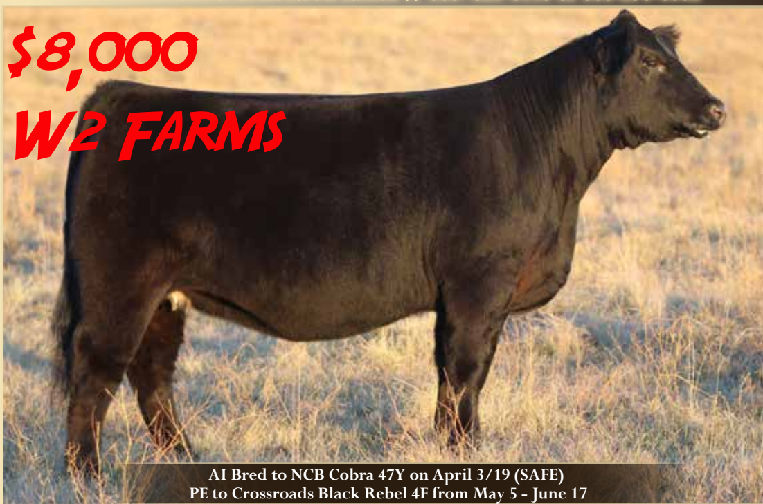
AI Bred to NCB Cobra 47Y on April 3/19 (SAFE) PE to Crossroads Black Rebel 4F from May 5 - June 17