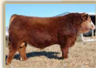
Son / Springcreek Blue Chip 9D

LOT 29A - 29C) 3 lots of 10 units each of Springcreek Liner 56U (30 total) Semen stored at Alta Genetics - Canadian, U.S. & Australia qualified