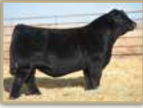
Sire of c) embryos KCCI Exclusive 116E

26A) $5,000 AG LAND FARMS 26B) $3,000 VISTA VENTURES 26C) $2,550 TYSON GARDNER