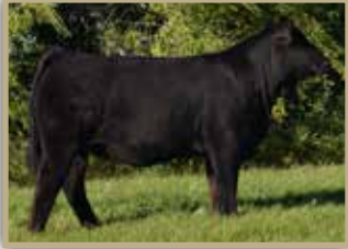
Erixon Lady 101B / Full Sib to dam

ce 6.8 bw 3.9 ww 73.4 yw 107.1 mce 1 mww 57.4 milk 21.0 api 110.28 ti 65.51