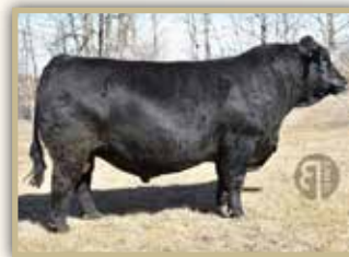
Sire / WLB Bounty Hunter 365C

ce 8.8 bw 2.5 ww 70.7 yw 109.9 mce 4.3 mww 57.6 milk 22.2 api 120.05 ti 69.61