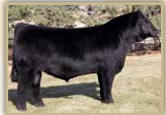
Pat. Grandsire / High Voltage 244X

SS/PRS HIGH VOLTAGE 244X S: KBL DANTE 13D SUNNY VALLEY SPICE 20A CDI AUTHORITY 77X D: KWA MS AUTHORITY 55D ACS RED MARCUS 775T