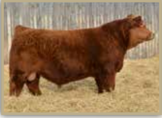
Boundary Motley 77F / Mat. Sib