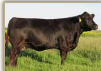
Dam / CMS Soda Pop 412B