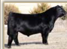
W/C Relentless 32C Sire of 1A