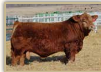
Sire / Wheatland Kill Switch

ce 6.4 bw 4 ww 74.1 yw 109.8 mce 6.1 mww 62.9 milk 25.8 api 112 ti 67.57