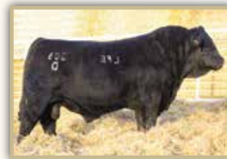
Sire / LFE Beast Mode 305D

LFE BS LEWIS 420B S: LFE BEAST MODE 305D LFE BS OPAL 630X NCB COBRA 47Y D: LFE BS MARY 113B LFE BS MARY 172Z