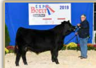
Full Sib / Simmental Bull Calf Champion

ce 8.7 bw 2.7 ww 84.2 yw 129.9 mce 2.8 mww 61.8 milk 19.7 api 124.76 ti 78.54