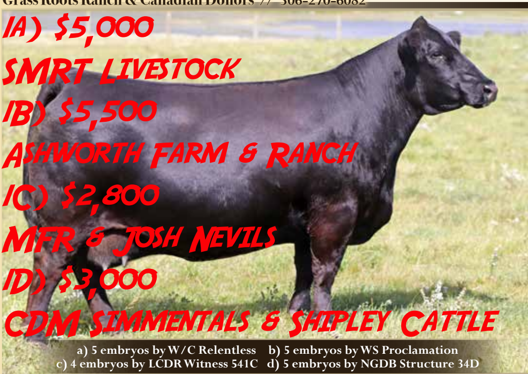
a) 5 embryos by W/C Relentless b) 5 embryos by WS Proclamation c) 4 embryos by LCDR Witness 541C d) 5 embryos by NGDB Structure 34D