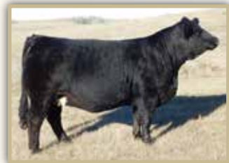
Dam / SVS BLK Satin 783E

HOOKS SHEAR FORCE 38K S: WHL GOLD KEY 1619D CMS SODA POP 417B MADER WALK THIS WAY 224B D: SVS BLK SATIN 783E SVS RED SATIN 524C