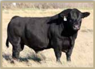
Mat. Grandsire / MRL El Tigre

BOUNDARY Sweet Marie 193G Red / Homo Polled / 1276246 / BOUN 193G / Feb. 10, 2019 / bw-96 / ww-670 Sweet Marie 193G is soft made and angular, and with her bold, sweeping rib cage, she definitely has a certain presence about her. Her young dam is a fancy, clean made, Authority daughter, with lots of neck extension, that is already leaving her mark. Her son Motley 77F was a feature at last year's Southwest Showcase Bull Sale, selling to Doll Simmentals in North Dakota. He was also a member of our Champion Pen of Bulls at the Medicine Hat Pen Show last fall. A 3/4 brother to him, Motley 163E, was the anchor to our show team in 2017. A 3/4 brother to Sweet Marie's dam was a member of the Champion Pen of Bulls at the pen show in 2015 and went on to sell for $50,000. The style, correctness, and phenotypic presence of the cattle produced from this cow family has been undeniable and we feel Sweet Marie 193G will proudly carry on her family's legacy.