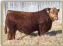
IPU Lieutenant 24E Lot a) Sire of embryos

lot 26 a-c At the 2016 National Western Stock Show, GVC Blackstar created tons of buzz and commanded $60,000USD. We were excited to team up on her full sister with Black Gold Simmental for $40,000 USD and she has proven to be a great producer. This young donor has developed into a beautifully uddered female with a bigtime look. Her first progeny have been well received, commanding $25,000 and $8,250 through Friday Night Lights in 2018 plus a herd sire retained at Harvie/KT that was recently selected the Grand Champion Bull. Ava is sired by the female maker Built Right, whose popularity has stood the test of time and been proven out through his daughters. The matings on offer are some of the best we can make and guarantee a happy customer when they hit the ground ... our confidence in Ava B408 is as good as any in the industry!