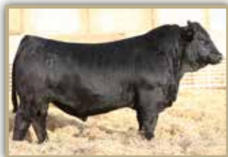
Sire / LFE Night Hawk 3013D

ce 13 bw -1.5 ww 57.8 yw 84.9 mce 6.7 mww 56.1 milk 27.2 api 130.32 ti 65.31