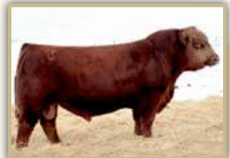
Mat. Grandsire / CDI Authority 77X