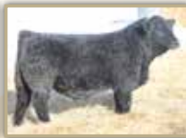
ANC GVR Cash Money 8114 $10,000 Son

27A) $2,700 REDRICH FARMS 27B) $3,500 COULEE CROSSING