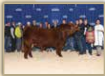
Captain Scream Mat. Sib