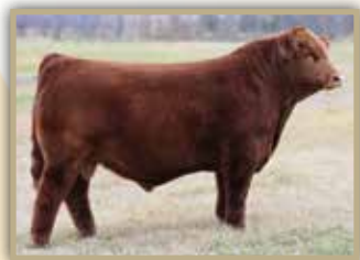
Sire of embryos / Captain Scream 63D

SVS Jewel 955G comes to you with a fresh, exciting pedigree. Her sire, Classified, is the $70,000 high seller out of the Hudson Pines dispersal. Her dam, 135D, is a $43,000 high seller out of the LaBatte program. 135D is a donor female that you will hear a lot more from in the future. 955G herself is extremely attractive, well balanced and sound structured. Her disposition is excellent, she has a great hair coat and will be very competitive in the show ring. Jewel 955G is loaded with potential and is one that we hate to part with!