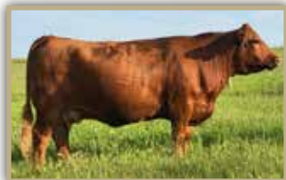
Ms Currency 278C /Dam

ce 4.3 bw 3.9 ww 64.1 yw 96.9 mce 2.6 mww 58.1 milk 26 api 121.98 ti 65.13