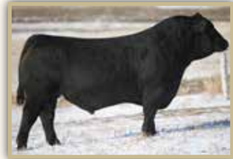
Sire / WHL Gold Key 1619D