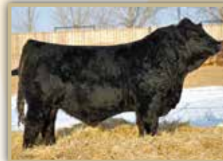
Sire / Captain Black 430B

SVS CAPTAIN MORGAN 11Z S: RF CAPTAIN BLACK 430B TLG FLIRTIN WITHYOU W/C WIDETRACK 694Y D: ALLIANCE BLACK SARAH BOUNDARY SARAH 7C