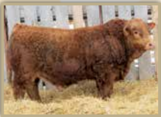
Sire / Red Century 6200D