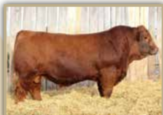
Sire / MRL Outlaw 255D

Here is a solid red heifer that you really need to admire for her length of spine, depth of rib and extension in her neck. She is a loose made heifer that is loaded with athleticism and has a pretty skull to boot. We are big on disposition and this girl has been great since the first day on the halter. Big time cow prospect as her pedigree is loaded with maternal traits especially with Red Western on both sides of the pedigree. You won't miss this heifer come sale day!