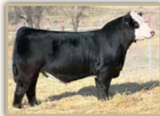
Sire / W/C Loaded Up 1119Y