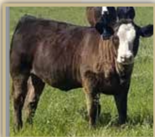
Full Sister in July

WHEATLAND FINAL AFFAIR WHEATLAND BENTLEY 630D WHEATLAND LADY 72X MR NLC UPGRADE U86760 CLAYHILL FANCY LUCA 39A CLAYHILL FANCY PANTS 32S