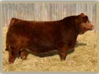
Boundary Motley 163E / 3/4 Sib to 77F