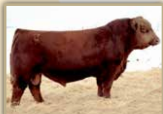
Mat. Grandsire / CDI Authority 77X

ce 3.7 bw 4.2 ww 76.1 yw 114.2 mce -2 mww 61.2 milk 23.1 api 117.97 ti 68.13