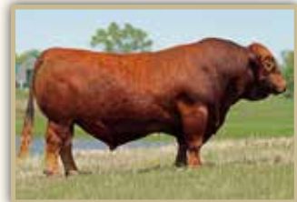
Sire / Red Rocket

MRL 130Y S: COME AS U R RED ROCKET MISS XCITING 14X PHEASANTDALE MR FORCE 78A D: PHEASANTDALE MS RBF 12C PHEASANTDALE MS 224A