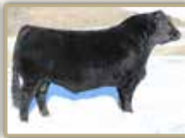
Structure 34D Lot b) Sire of embryos