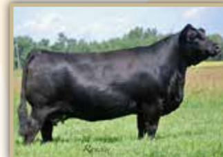
Dam / Certainly Flirtin 202Z

3C W/C RIGHTTRACK W9462 S: W/C WIDETRACK 694Y MISS WERNING 694S WHEATLAND STOUT 930W D: RF CERTAINLY FLIRTIN 202Z RF FLIRTIN FOR CERTIN 37U