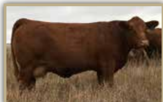
MRL 5356C / Pat. Grandam