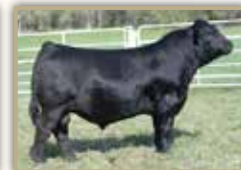
WS Proclamation Sire of 1B