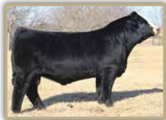
Sire / TKCC Classified