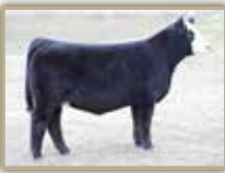
$8,250 daughter of Ava Black Gold Ms Ava 88F