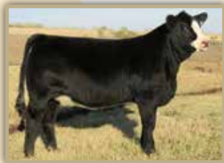
Mat. Sib / CMS Centrefold 848F

ce 4.5 bw 3.9 ww 78.6 yw 117.2 mce -0.6 mww 60.3 milk 21 api 114.26 ti 67.89