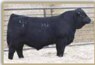
Mat. Grandsire / LFE Riddler 323B

ce 7.6 bw 2.7 ww 83.8 yw 127.4 mce 4 mww 68.4 milk 26.5 api 128.77 ti 76.88