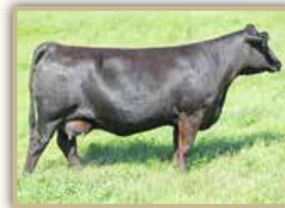
Dam / LFE BS Mary 113B

ce 11.2 bw 0.8 ww 61.9 yw 99.3 mce 6.3 mww 57.1 milk 26.1 api 127.31 ti 63.75