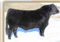
NGDB Structure 34D Sire of 1D

JF MILESTONE 999W HPF CREAM SODA Y010 IC CREAM SODA R56