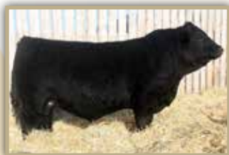
Sire / SVS Stone 731E

GFD Caught You Looking 1G has been a standout since birth! Her name says it all. She has the eye appeal, natural spring of rib, freshness through her front end, and power coming from all four corners. Not only is she phenotypically correct, she has a pedigree packed full of greats! When you combine Stepping Stone, Riddler, Captain Morgan, Destiny Dream Eileen, and Younique, the potential is endless! You won't want to miss her come sale day! Homo Polled by Parentage.