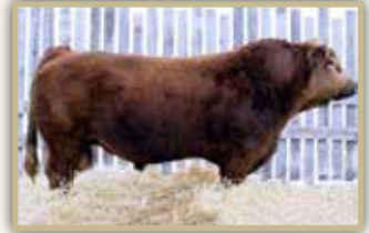
Sire / LER RedTeddy 457P

WHEATLAND BULL 131L S: WHEATLAND RED TEDDY 457P WHEATLAND LADY 902J LFEBISS BLACKADVANCE 426U D: SCSF RED CASH 37A LC BLACK 59T