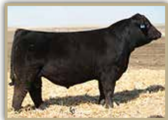
Mat. Grandsire /CCR Cowboy Cut 5048Z

ce 7.3 bw 2.5 ww 80.6 yw 118.5 mce 3.3 mww 63.4 milk 23.1 api 142.57 ti 79.23