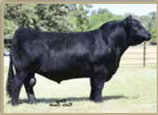
Sire / Harkers Icon

ce 8 bw 3.5 ww 73.5 yw 111.8 mce 2.2 mww 59.5 milk 22.5 api 117.19 ti 66.78