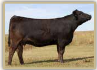
Mat. Grandam / LC Black 59T