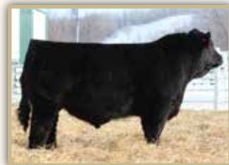
Sire of Service Sire / Terminator 215Z

WHEATLAND NITRO 64X S: WHEATLAND BULL 215Z WHEATLAND LADY 882U SAST101 SWEET MEAT D: MCINTOSH CHLOE 7Y IPU RED POCAHOTAS 139M