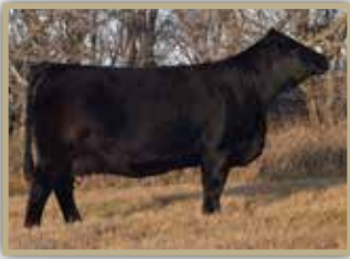
Erixon Lady 38B / Full Sib to dam