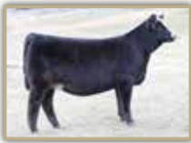
$25,000 daughter of Ava Black Gold Ms Ava 125F