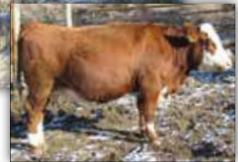
Opal 21D, dam of lot 4