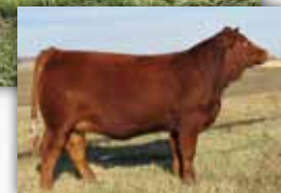
CMS 834F, flushmate of lot 31