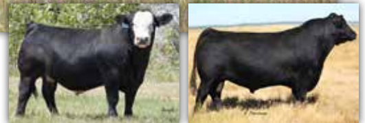
Bentley 81F, service sire of lot 36 Motive, mat. grandsire of lot 36