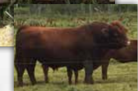
Red Mountain, sire of lot 23