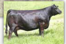
Sheila 82A, dam of lot xx