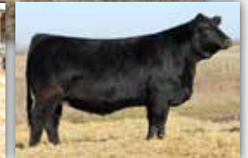
Lady 92D, dam of lot 50