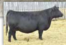
Linette, dam of lot xx