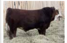
Dakota 9Z, sire to lot 1