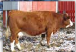
Sadee 2D, dam of lot 5