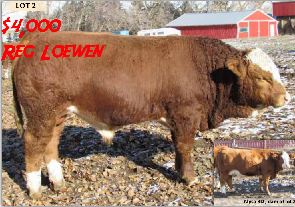
Alysa 8D, dam of lot 2