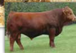
Capone 130B, sire of lot 19