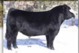
Broker, sire of lot 27