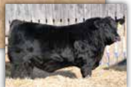
JTC 4F, out of same cow family as lot 56