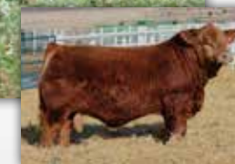
Kill Switch, sire of lot 54