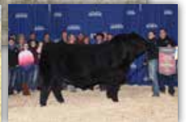
Royal Flush 435, sire of lot xx