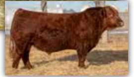
Red Heat , service sire of lot 9