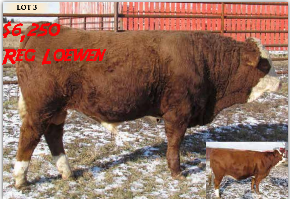
Ella 24D, dam of lot 3