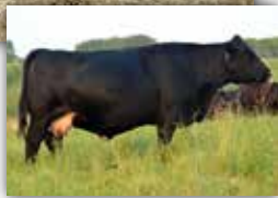
Miss Bring 321N, dam of lot 52