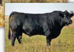
Absolute, service sire of lot 20