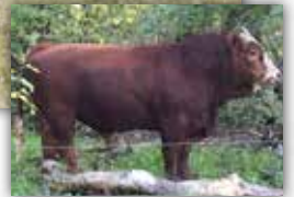
Shade, service sire of lots 38-40