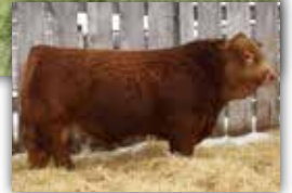
MRL 91Y, sire of lot 46