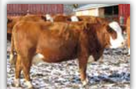
Nola 22C, dam of lot 3