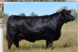
91A, dam of lot 43