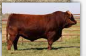
Red Summit 54B, sire of lot 51