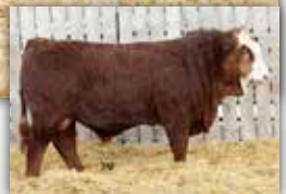
Taqa 124D, sire of lot 10