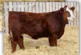
Mr Kracker 117D, dam of lot 11