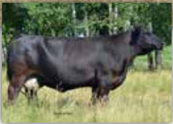
Whisper 76T, mat. sib of lot 52

This is the only direct daughter from our "Blackie" donor that we have ever consigned to a sale. We have retained almost every daughter of 321N as she built the most consistent, best footed and easiest keeping cow family in our black program. She and her daughters have raised us many show winners, sale features and high sellers over the years, including a flushmate brother to 62G that was one of our high sellers in 2018. This is one of our largest cow families because the Blackie females have been so productive. The last Blackie female sold was a 321N granddaughter who went to Spring Creek Simmentals. In 2019, that female's first son sold for $11,500 to Rusylvia Cattle Co. 62G looks a lot like her great dam, is very quiet, boasts an adj WW of 732 lbs and will mature into a front pasture cow like every one of her sisters.