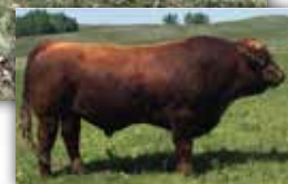
Cypress 48E, service sire of lot 30