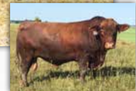
Centerfire, sire of lot 22