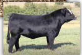
Vision, service sire of lot 41