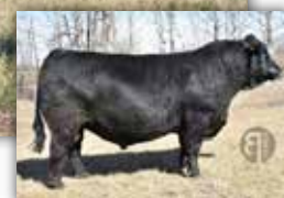
Bounty Hunter, service sire of lot 53