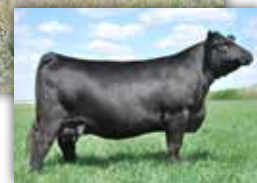
37U, grandam of lot 24