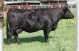
LFE 30X, great granddam of lot 42