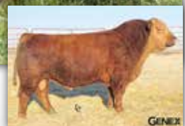
High Stakes, sire of lot 45