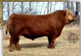
Sheriff 8A, sire of lot 8