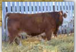
MMV 113D, mat. sib of lot 7