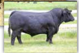
Cobra, sire of lot 21