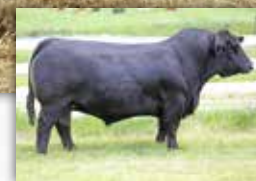
Cobra 47Y, sire of lot 17