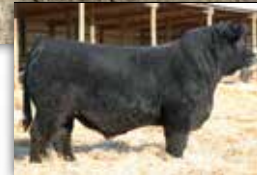
Denali, sire of lot 50