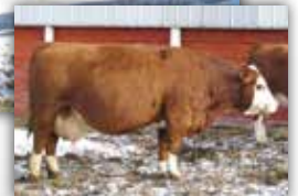
Jayla 17U, dam of lot 6