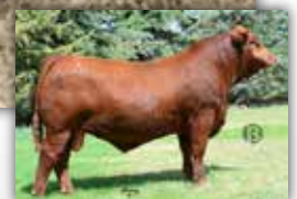
Bootlegger, sire of lot 16