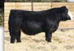
Style 363B, sire of lot xx