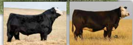
Shell Shocked, sire of lot 37 Swagger 6612, dam of lot 37