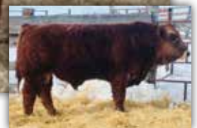
CW Freddy 34F, full sib of lot 15