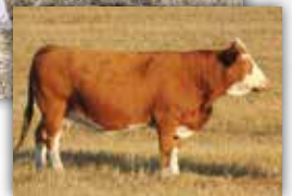
412W, pat. great grandam of lot 12