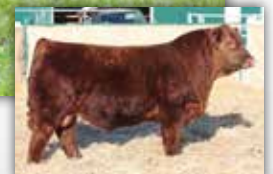
Front Runner, service sire of lot 47