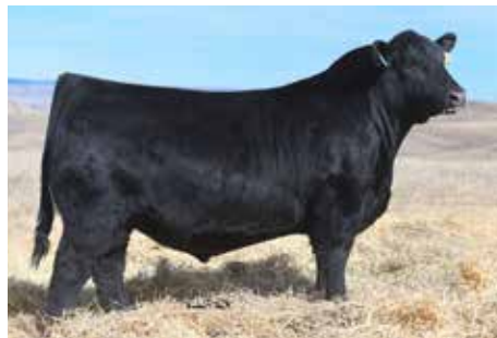
SQUARE B ATLANTIS 8060

LOT 39 RECIP: THIS 2020 BORN FEMALE CAME FROM THE LEAD COMMERCIAL PEN AT THE ANDERSON BULL SALE AND IS NICELY MADE.