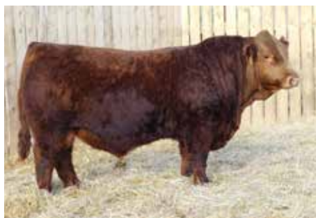
$110,000 RANCHER, SON OF SAMMIE

LOTS 1-2 RECIPS: BOTH OF THESE RECIPS ARE COMING 3-YEAR-OLD BLACK COWS THAT ARE GOOD UDDER, SOUND AND PRODUCTIVE. VERY HAPPY WITH THE HARD WORKING COWS WE PURCHASED FROM WHITTEMORE.