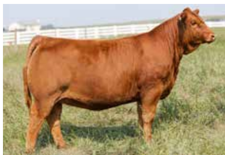
$42,500 DAUGHTER OF SAMMIE