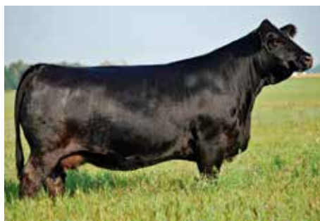
FLIRT 404B, PATERNAL GRANDAM