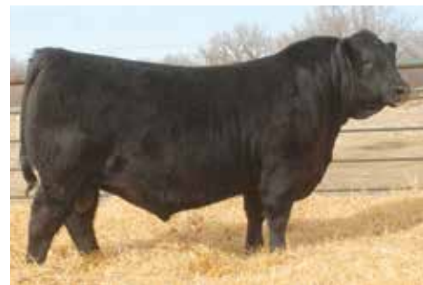
ELLINGSON BIG RIVER 0052