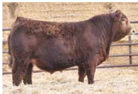
$161,000 REDDINGTON, SIRE OF LOT 7-9

R PLUS VENOM 4006B | MRC SUPREMACY 260B R PLUS REDDINGTON 0143H | CROSSROAD FRANKIE 68F MISS R PLUS 6168D | ERIXON LADY 16B \ HP-HOP CC-RC