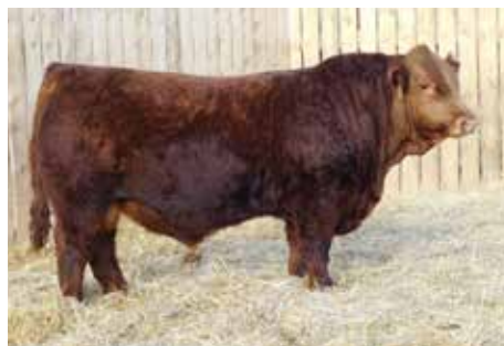
$110,000 RANCHER, SIRE OF LOT 6, 10 & 11

SVS TYCOON 841F | R PLUS 5015G SVS RANCHER 42H | MISS R PLUS 9163G HLTS SAMMIE | MISS 6JR 45Y