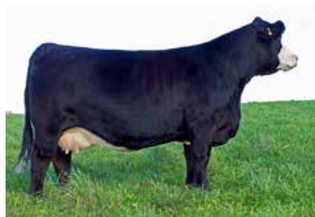
BRIGHT N CLASSY, DAM OF 9236G

SVS TYCOON 841F | R PLUS 5015C SVS RANCHER 42H | MISS R PLUS 9236G HLTS SAMMIE | JETSTREAM BRIGHT N CLASSY