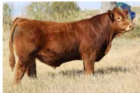
B BAR STETSON 35H

LOT 41 RECIP: A RED COMMERCIAL RECIP COW THAT CAME UP FROM TRANSOVA IN SOUTH DAKOTA AND RAISED A HEAVY CALF LAST FALL. NOTE, SHE IS AN OUTSIDER COW THAT NEEDS SOME ROOM BUT HAS DONE A GREAT JOB WITH HER PRODUCTION THUS FAR.