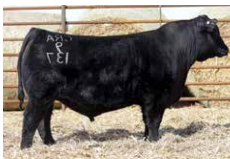
SIRE OF EMBRYO CALF - GUARANTEE