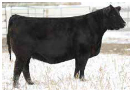
$11,000 DAUGHTER OF LOT 37 RECIP

LOTS 37-38 RECIPS: FIRSTLY, I KNOW WE GONE AND MESSED UP WHEN WE IMPLANTED AN EMBRYO IN THE LOT 37 RECIP, 31C. BUT BEFORE WE ACCESSED THE PACKAGE OF 26 WHITTEMORE PAIRS, WE WERE VERY SHORT ON RECIPS AND WERE UTILIZING ANY STRONG COW WE WEREN'T FLUSHING. 31C RAISED A $11,000 NATURAL DAUGHTER AND SHE HERSELF IS A HIGH QUALITY COW. SHE WILL SELL WITH PAPERS AND NEVER NEEDS TO RECEIVE AN EMBRYO AGAIN. LOT 38 RECIP IS A STRONG COMING 3-YEAR-OLD PAPERED FEMALE THAT HAS UNANIMOUS & NET WORTH AND DID A GREAT JOB ON HER FIRST CALF. 2 VERY STRONG COWS HERE THAT BOTH SELL WITH PAPERS.