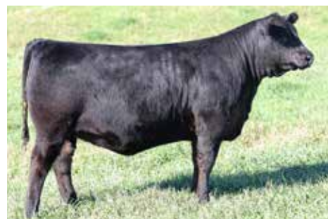
ANCHORAGE LADY BLASTER 0444, DAUGHTER