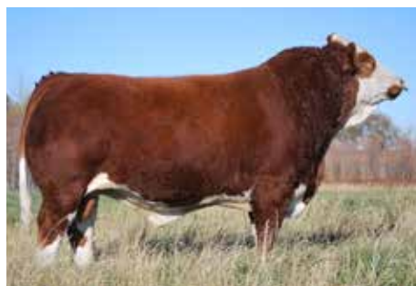
ANCHOR D VIPER I03W

LOTS 14-15 RECIP: NOTE, LOT 14 RECIP IS A PUREBRED SIMMENTAL BRED HEIFER THAT IS WESTGOLD BREEDING THROUGHOUT. VERY GOOD FEMALE THAT YOU CAN INVEST IN WITH CONFIDENCE. LOT 15 IS A GOOD LOOKING RED COMMERCIAL FEMALE THAT WAS SENT TO US FROM THE USA, ONE OF THE BEST LOOKING COWS AT OUR PLACE IN LONG GRASS - NOTE, SHE DOES ROLL ON HER BACK RIGHT FOOT BUT DOESNT EFFECT HER AND SHE RAISED THE HEAVIEST CALF LAST FALL.