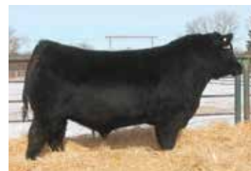
PEAK DOT COLOSSAL 1073G, SON OF 541B

LOT 35 RECIP: LUTE, TIGER, DENSITY AND THE KARAMA COW FAMILY ALL WRAPPED UP IN A HIGH QUALITY YOUNG FEMALE. WE LIKE THIS ONE AN AWFUL LOT AND FOR GOOD REASON, WE CONFIDENTLY CAN SEND THIS TYPE OF FEMALE ANYWHERE AND IS CARRYING AN EXCITING CALF.