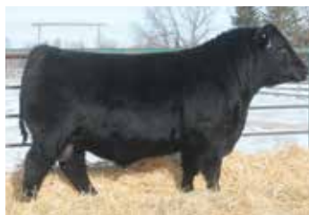
PEAK DOT COLOSSAL 1056G, SON OF 541B