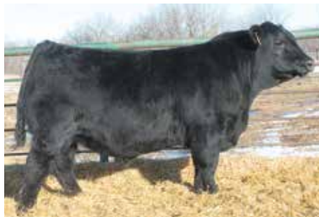
PEAK DOT ELIMINATOR 77C, SON OF 239A

LOTS 32 RECIPS: FIRST CLASS, CLASSEN, 004, FREEDOM 104, FINAL ANSWER ARE ALL REPRESENTED IN THIS COMING 4-YEAR-OLD REGISTERED FEMALE THAT IS VERY NICE IN HER TYPE.