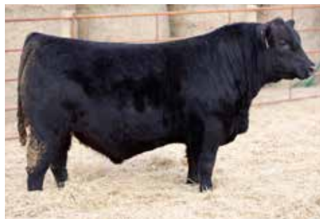
$11,000 SON OF EXAR TRAVELER 1121