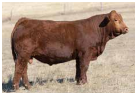
MAF MR 167J - SON OF 48C