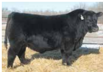
PEAK DOT ROUGHRIDER 1071G, SON OF 541B

PEAK DOT PROOF 1066X PEAK DOT HEATHER 541B HEATHER OF PEAK DOT 850X