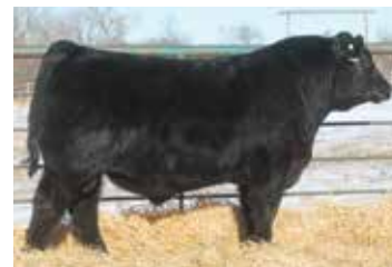
PEAK DOT ROUGHRIDER 1113H, SON OF 541B