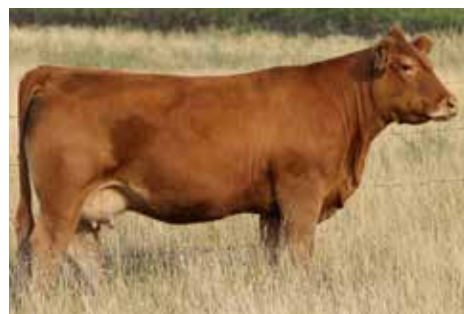
KARISMA 57E, DAM OF STETSON