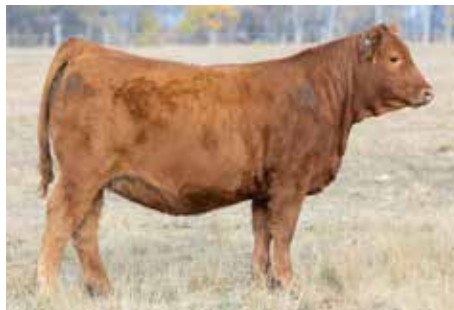
MAF SEANNA 129J - DAUGHTER OF 48C

LOT 12 RECIP: STRONG RED BACLDY 4-YEAR-OLD RECIP FEMALE THAT WE RECEIVED FROM DAVIS RAIRDAN, SHE IS A GOOD FEMALE.