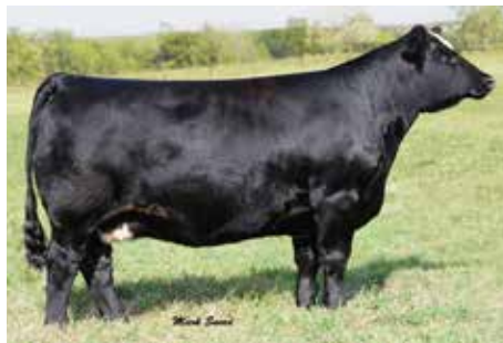
JOYS ELEGANCE, MATERNAL GRANDAM