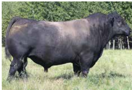
OCC LEGACY 839L

O C C ECHELON 857E | S A V BISMARCK 5682 O C C LEGACY 839L | MTC ABIGALE 7178 O C C DIXIE ERICA 960E | S A V ABIGALE 9144