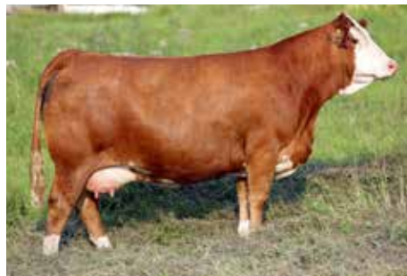
ULTRA ELIZA 749E, FULL SIB TO 748E

DOUBLE BAR D MAESTRO 100S | ANCHOR D RAPTOR 392C ANCHOR D VIPER I03W | WJS ERIKA 748E PRL LOPEZ 147L | PHS YOUR CHOICE