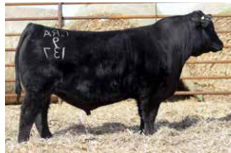
CRAWFORD GUARANTEE 9137

LOT 40 RECIPS: ANOTHER STRONG YOUNG COMING THREE-YEAR-OLD BLACK COMMERCIAL FEMALE. WE ARE VERY HAPPY WITH THESE YOUNG RECIPS.