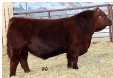
$16,000 MERLOT, SON OF MABEL 60A

LOT 25-28 RECIPS: THESE ARE FROM THE GOOD GROUP OF COMING 3-YEAR-OLDS THAT RAISED STRONG CALVES AND HAVE A LIFETIME AHEAD OF THEM.