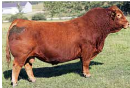
$120,000 BETTS, SON OF SAGE

SAGE 506C HAS BECOME A WORLD-RENOWNED DONOR COW THAT HAS TRULY BEEN A "GREAT ONE" IN EVERY SENSE OF THE MEANING. SHE IS SPECIAL AND HOLDS A CLOSE PLACE TO OUR HEART AS SHE HAS EVOLVED INTO AN INCREDIBLE BREEDING PIECE THAT KNOCKS THEM OUT EACH AND EVERY TIME, NO MATTER HOW SHE IS BRED. SHE HAS SURPASSED A HALF A MILLION DOLLARS IN PROGENY SALES FOR ALL THAT HAVE MARKETED HER PROGENY. MOST NOTABLE SONS WOULD BE THE $120,000 BETTS THAT IS A TRUE BREEDING LEGEND AND THE $60,000 DYNASTY THAT WAS GRAND CHAMPION BULL AND FIRST CALF CROP LOOKS INCREDIBLY GOOD. THE 3 RECIPS ARE ALL CARRYING SAGE CALVES OUT OF THE EXCLUSIVE REDDINGTON THAT BROUGHT $161,000 THAT WAS THE TALK OF THE SPRING IN 2021. OFTEN REFERRED TO AS THE MOST EXCITING AND COMPLETE RED BULL THE BREED HAS SEEN IN SOME TIME WHO STANDS ON A STRONG FOOT AND BACKED BY A TOP COW FROM R PLUS.