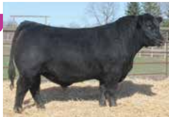
PEAK DOT ATTRACTIVE 371H, SON OF 541B