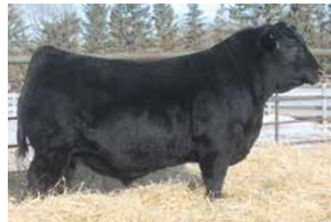
$35,000 PDAR 83H, SON OF 247C

LOT 33 & 34 RECIPS: THESE ANGUS BASED 2019 BORN FEMALES RAISED STRONG CALVES IN THEIR FIRST ATTEMPT AND WERE VERY FERTILE WHEN BREEDING BACK TO CARRY THESE EMBRYOS,