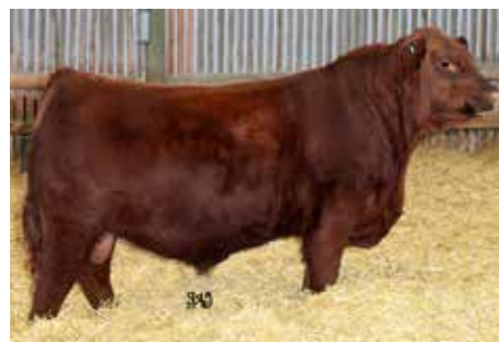
$46,000 MALBEC, SON OF MABEL 60A

RED HOWE MAGNUM 169W RED MINBURN COPENHAGEN 3Y RED U2 GENESIS 103G RED U-2 MABEL 60A RED U-2 LAKOTA 54B RED U-2 MABEL 706IT