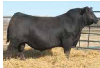
PEAK DOT NO DOUBT 153F, SON OF 541B