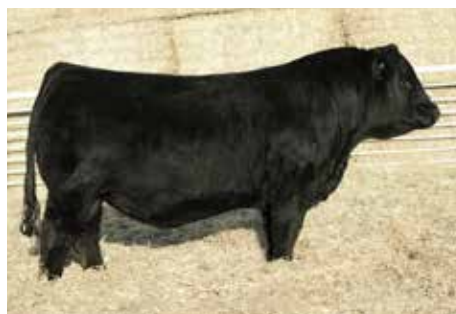
$60,000 DYNASTY, SON OF SAGE