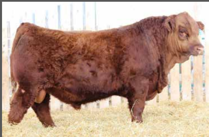
MRL CENTRIUM 27J