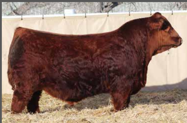
WHEATLAND IMPACT 163J