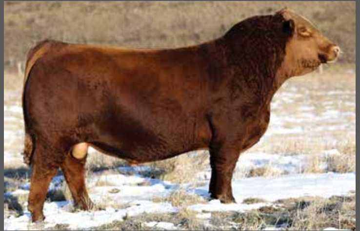
KWA ROOSEVELT 63F