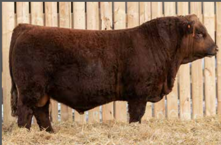
WFL MOUNTAIN VIEW 4J