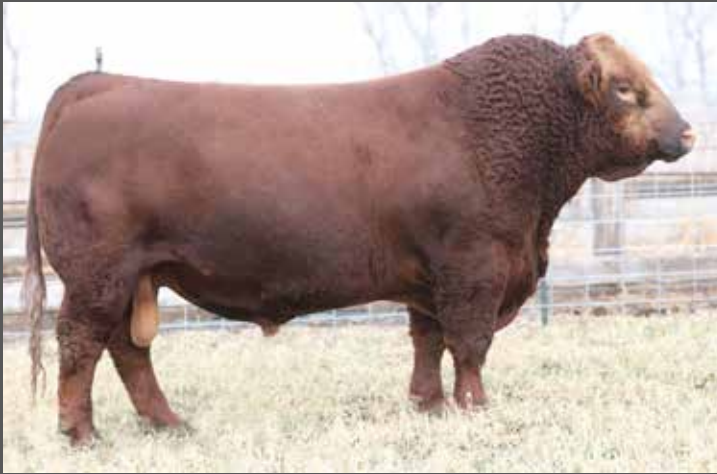
WFL WESTERDALE 6E