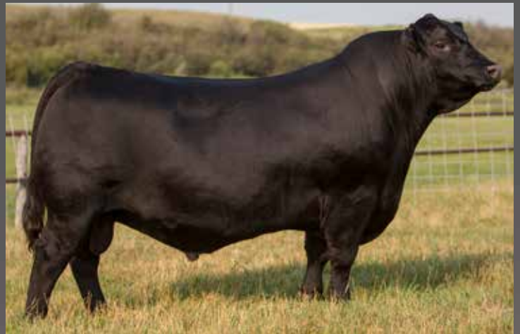
BROOKING EMERALD 9179