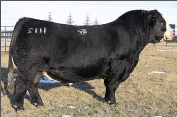
RF NO LIMITS 1112J