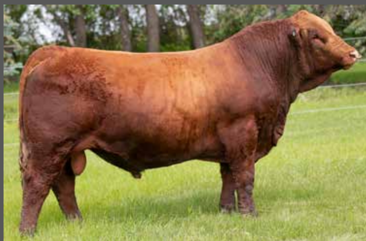
MRL PLAYMAKER 36G