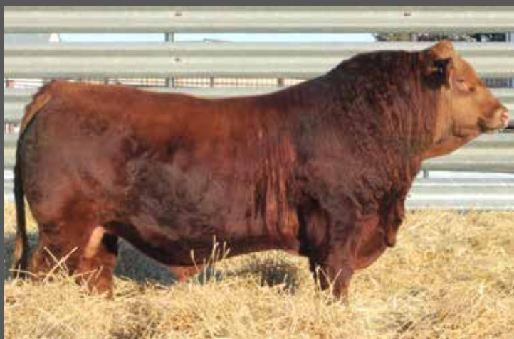
KWA MONARCH 54H