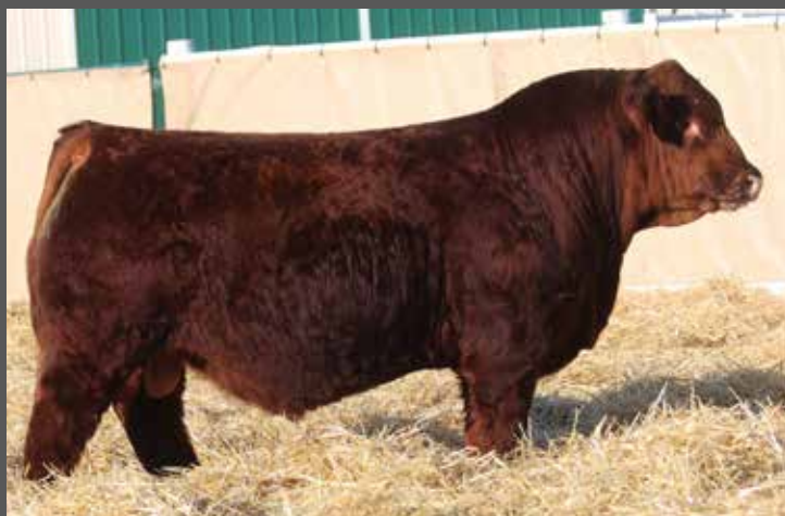
WHEATLAND NEXT CENTURY 43H