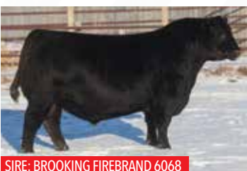
SIRE: BROOKING FIREBRAND 6068

A Brooking Firebrand son of the great donor female Miss rusylva 4X a direct SAV net worth daughter. This guy would be a half brother to the trio of brothers just ahead of him. If your looking for a more moderate and stouter package this will be one you have marked. You'll love this bull for his style and overall appearance with that awesome hair coat.