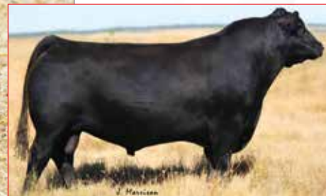
SIRE OF LOTS 46, 49 & 50