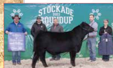
RESERVE GRAND CHAMPION AOB BULL

This is definitely the feature bull in the Maine pen. He is absolutely a powerhouse as thick and deep as they come. He can go out and sire calves that would take anyone's program to the top. He's even got a proven show record as being the Grand Champion Maine Bull at Farmfair and Agribition, Champion Maine in the President's Cup and Reserve Champion AOB Bull at the Stockade Roundup. Take note, he's an ET calf off our proven high producing donor cow Calla 47C who herself has been an instrumental building block for our program. 10L weaned, the heaviest at just under 800 pounds on August 21.