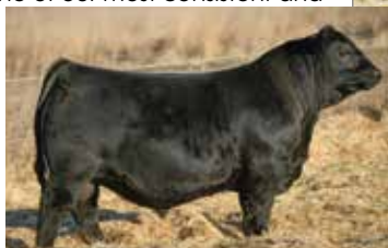
SIRE: U2Q NOVEMBER RAIN 5H

The one and only November rain son this year with being most of the calf crop heifers that are highlights in this past fall sale run and the replacement pen. This guy is off one of our most consistent and correct angus cows in the herd. This guy is down right good and think there is a lot of value in this individual. We continue to use November rain consistently in the angus program and highly recommend taking advantage of this son.