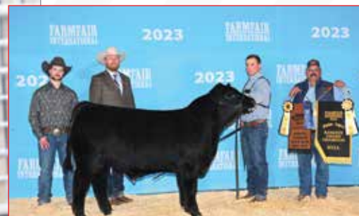
RESERVE GRAND CHAMPION MAINE BULL