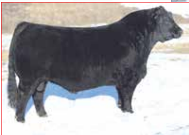
SIRE OF LOTS 6-10

This structure son has been a pen favorite for some time now and when you lay eyes on him you will understand why. His dam is $30,000 FNL sale feature and has been a top producer here at Rusylva. This bull is packed with natural muscle and shape and has those true herd bull features we look for. This is a bull that gets out and move's great on a big square foot. Not only being back by some of the great pedigrees in the breed but also has the quality to make it. This will be one you will want on the short list. HOMO POLLED .