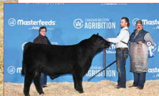
RESERVE GRAND CHAMPION MAINE BULL