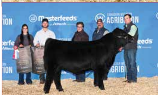
GRAND CHAMPION MAINTAINER BULL