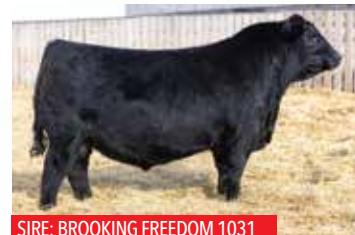
SIRE: BROOKING FREEDOM 1031

Here is the first offspring of the one and only $30,000 brooking freedom bull that we had the honour to purchase alongside side some great partners at JK Bar cattle and Shologan cattle. This guy is an overall favourite in the pen this year.