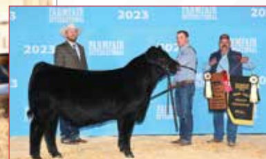
GRAND CHAMPION MAINE BULL