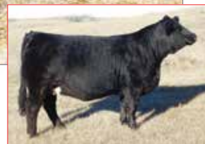
DAM OF LOT 7