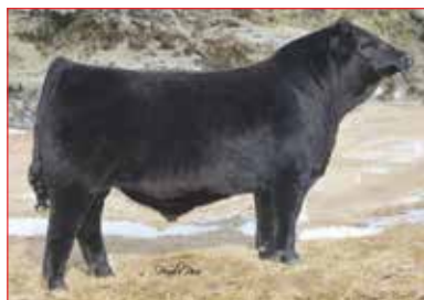
SIRE OF LOTS 11 &amp; 12

A set of ET brothers off the famous SVS captain Morgan and the 425B donor at double bar D's. These are some bulls with extra body and stretch to them and a good look. Think you could go either way with these 2 and be happy with how they mature out and what there offspring will do for your operation. 2 very high quality and fault free bulls here. HOMO POLLED.