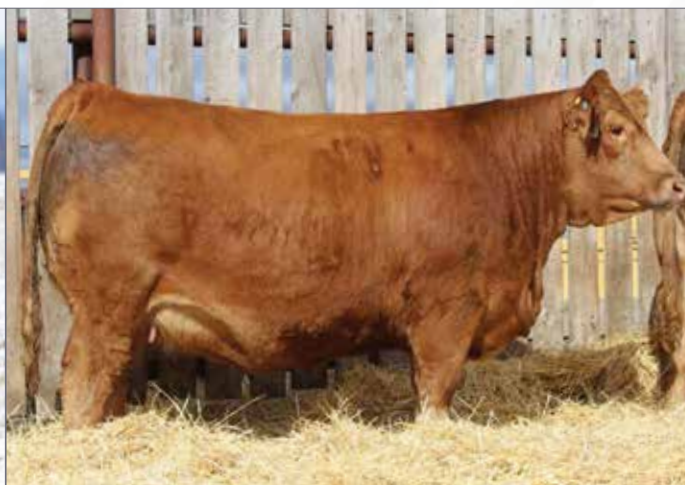
MADER WALK THE LINE 92J X MRL MISS 7362E