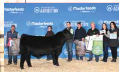
GRAND CHAMPION MAINE BULL