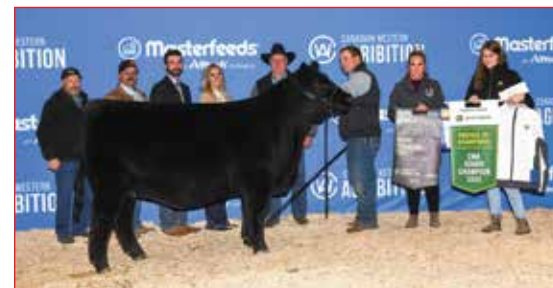
FULL SIB TO LOTS 43 & 44