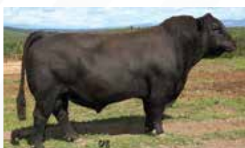
SIRE OF LOTS 25, 26, 27, 29 & 30: BAR-E-L NATURAL LAW 52Y