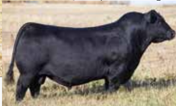
SIRE OF 33 &amp; 34: BROOKING BANK NOTE 4040

Here is the performance bull of the sale. This guy is long bodied, deep sided, big topped and a bigger frame option. With having bank note and SAV harvester in his pedigree you know the power and performance and longevity is bred in here. The guess work is already done on this guy.