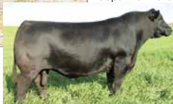
SIRE OF LOTS 31 &amp; 32: S A V HARVESTER 0338

Like always we have a handful of direct SAV harvester son in the offering. And think this guy leads of the sire group quite handily with the amount of body and shape and the extra rib he has and yet keeps that natural shape and muscle we look for in any herd bull prospect. What makes this bull even better is his dam a direct SAV Density daughter who has been a no miss female every year. This will be one that'll you will want marked down.