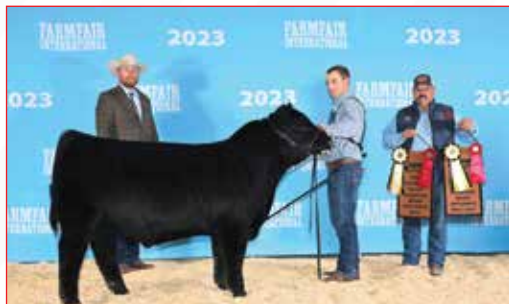
GRAND CHAMPION MAINTAINER BULL