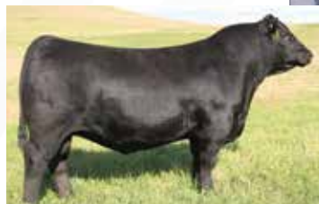
SIRE: S A V PRESIDENT 6847

It is quite easy to sit here and write footnotes on bulls like this and with the past history of his full brothers throughout our past sales. A powerful, correct made and fault free bull here. This full brothers have highlighted the angus pen every year with them selling to Rocking Heart Range and Deagle Cattle Company. Bulls like this are real cattlemen's type and kind.