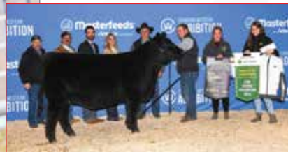
DAM OF LOT 46