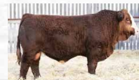
SIRE OF 32L & 38L

Sporting a near perfect blaze, excellent foot quality and great hair coat, 32L and 38L tick all of our boxes. These bulls are quiet and patient and ready to go to work. The boys are sure to add lots of weight to your calves for the fall calf run! The sire, Ultra/Hval Freedom 125J is an outstanding bull that has improved our herd immensely by delivering strong and uniform calves. We don't worry about what kind of calves we will get out of Freedom because the calves perform the same way every time, and we believe his offspring will go on to do the same, providing you with peace of mind. Freedom has also provided us with 12 replacement heifers, all of which are in close competition for the top female spot in the pen. Actual weaning weight of 32L is 915 lbs and 38L is 840 lbs on September 20th. Homo Polled, Non-Dilutor.