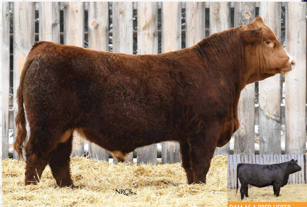
DAM AS A BRED HEIFER