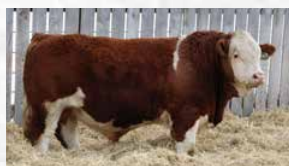
FULL SIB, WOLFES JACKHAMMER FF52J

Full Fleckvieh. They say good things come in threes: Three full brothers, three high end carcass bulls. Tremendous consistency. Our high seller in 2022 The Event Sale was a full brother going to 4M Cattle Company of Stauffer, AB and last years bull going to Warkentin Farms of Valleyview, AB. Livingston will follow in his brother's paths leaving terrific, predictable and consistent offspring. Have a good look at him on sale day. Actual weaning weight Sept 3: 920 lbs.