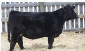
PAW 117J, MATERNAL SIB