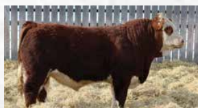
FULL SIB, WOLFES JIMMY FF30J

Full Fleckvieh. Leader is the 3rd full brother in a row from his mother. Consistency is what I would say about them. Wolfes Geronimo has crossed very well with Leader's Moses mother. Leader will calve good and produce great replacements. Non-Dilutor. Actual weaning weight Sept 3: 890 lbs.