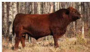
SIRE OF 1L & 12L

Being the first Copperhead calf on the ground for us, the arrival of 1L was highly anticipated, and he has delivered in every aspect. In the summer on grass this bull calf looked like he was out there ready to breed cows. We have heard breeders talk about putting the size back in to the Simmental breed and he does that with ease. He's big framed, has a nice long spine and is packed full of muscle. The dam is a very nice black cow purchased from the Skor dispersal sale and she is responsible for raising a top calf for us every year. SAS Copperhead G354 is a new AI sire for us and we are quite happy with the results so far! Actual weaning weight of 1045 lbs on September 20th. Homo Polled, Non-Dilutor.