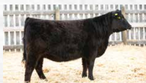
PAW 215K, MATERNAL SIB

PAW 364L is a deep bodied, smooth made bull that has a little extra style and presence. He started with just an 85lb birthweight, being a middle of February calf he just keeps getting better and better, and as an added bonus he's homo polled and homo black. This guy is out of a purebred angus cow that has all those beautiful angus traits you want. She has a great udder, beautiful clean front end and deep bodied. Mix that with his sire Coliseum, you get percentage bulls like these that can go out and add that clean style to your herd as well as that depth and hip shape to make the perfect combination. Homo Polled, Homo Black.