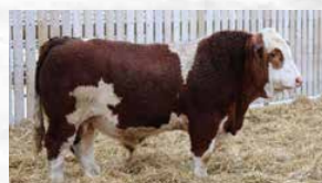
3/4 SIB, WOLFES DIXON FF22D

Wolfes Lambo FF23L Actual weaning weight Sept 3: 885 lbs.