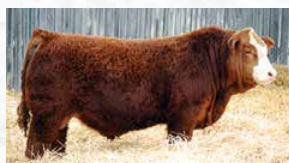
SIRE OF 93L & 17L

93L is a nice dark red heifer bull. You wouldn't believe me now, but when he started he was a very small 80 lb bull calf out of another first calf heifer. If you are looking to add a lot of performance to your herd and keep hair on your calves along with that blood red look he's your guy! He has that natural herd sire presence. Actual weaning weight of 990 lbs on September 20th. Homo Polled, Non-Dilutor.