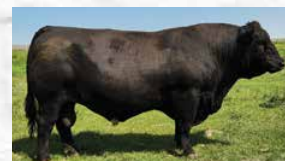
SIRE OF 320L, 322L, 339L & 364L

PAW Lance 320L is a bull that has been a heavy hitter right from the start. He is a performance bull that combines muscle and capacity with easy doing fleshing ability and an easy going attitude. He's full of performance in the right package that adds pounds and dollars to your bottom line. He is another Coliseum son that is looking to be just as big bodied and smooth fronted with the ability to go out and breed some cows in the pasture. He is out of a purebred Angus cow that has a great udder and the ability to produce and raise calves like this. This bull will be one to add the pounds to your bulls and produce females that you will want to keep in your herd. Homo Polled, Homo Black.