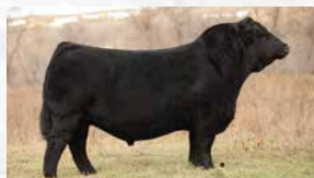
JUAN PABLO, FULL SIB TO SIRE

PAW Lightning Strike 309L is a long, balanced light birthweight bull that also comes with some cool markings. This calf was nicknamed Batman as a calf. His sire PAW BLK Gratitude 901G is a full sib to our PAW Juan Pablo 121J bull, who was Champion Bull at the 2022 Heartland Cattleman's Classic Bull Congress and was the $35,000 high seller from The Event Sale in 2022 to Wheatland Cattle Company. Juan Pablo went on to be the Grand Champion Simmental bull at Farmfair International last year and Made top 5 in the Alberta Supreme at Farmfair as well as top 10 in the Agribition Beef Supreme. This bull's genetics will be one you don't want to miss out on. Homo Polled, Homo Black.