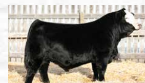
KINGPIN, FULL SIB