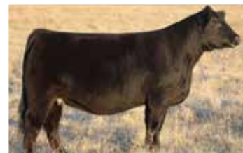
Dam - Black Gold GR Cream Soda 844

LOT 37: Another real high quality Crocket bull in our minds. Similar in build to the Lot 36 bull with a touch more frame to him. The dam backing this bull came from the Black Gold/ Grassroots programs and she has done a really good job since she's been here. Her first calf we sold as a bred through the Border City Sale for $12,000 out to Ontario and she has another really high end bull that will sell next year. This will be the only year to get these Crocket bulls from us and we think every one on offer has a bright future in front of them.