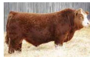
Sire - WLB Top Tier 456G

LOT 1: When we flushed our Pocahontas cow to the Top Tier bull this is exactly what we had in mind. Soft made, big hipped, easy doing cattle that keep the calving ease and birth weights in check. We can't say enough good things about this bull and the future we think he has in front of him. Lot 1, 2 and the yearling bull Lot 48 are all full siblings and all very high end bulls in our mind. Timber 27K is dark red, really big over that top and as hairy of a two year old as we have had go through this sale. When he gets out and goes he truly is impressive with the big square foot he sits down on. A true sale feature and one of the best bulls to come out of the W2 program.