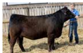
Dam- Rust Ms Robin 918G

A real complete bull in the black section out of a cow that came to us from the Rust program in North Dakota. Just an 84 lb bw, but a bull that still has enough power to him to compete with the big boys in the pen. 40K was one of our favorites on pasture