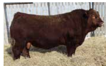
Maternal Brother - W2 Rubble

SVS BETTS 808F S: WF HIGH STAKES 58J CMS SODA POP 417B