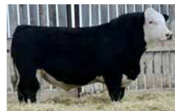
Maternal Brother - W2 Express

LOT 23: 51K was a twin which explains his 75 lb bw. We really admire the rib shape and dimension he exhibits and has from a young age. He is backed by a red baldy cow who we would say is larger framed then our average cow and keeps producing year after year. There's a reason so many Rival bulls made the sale the last couple years. They flat out work for the commercial cattlemen.