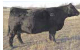
Dam - RCR Flirty Magilcuty 7D

An ET calf out of our Flirty Magilcuty cow who is our highest earning cow to date and still has a lot of miles left in her. She has been flushed numerous ways and each way seems to work. Proof being our last 2 lead off bulls and high selling bulls have both been out of Flirty. Our 2 highest selling females to date also have been Flirty daughters. The 34K bull is a larger framed bull who follows his sire Rival's frame size very closely.