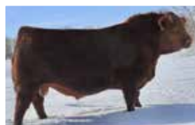
Sire - WF High Stakes 58J

Here's the natural calf off of our Pocahontas donor and the heaviest muscled calf and probably bull in the whole sale. We can't say enough good things about the 56G donor and we know she will play a bit role in our red division. When you have a cow of this quality behind your herd bull it sure makes the decision easier.