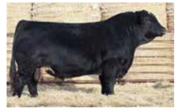
Sire - RF Magnitude 1178J