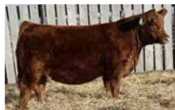
Maternal Sister - W2 Bombs Away

IF MILESTONE 999W S: WHF LIMITLESS B011 WHF SIERRA 245S