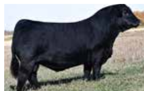
Sire - RF Caliber 014G