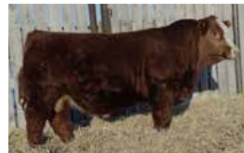
Maternal Brother = W2 Westside

SVS BETTS 808F S: WF HIGH STAKES 58J CMS SODA POP 417B