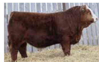
Full Sib - Lot 48