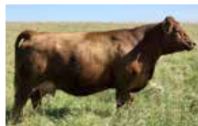
Dam - W2 Yara

With the high end dam behind him we think this bull has a lot going for him.