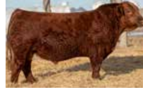
Maternal Grandsire - WHL Red Heat

We can't color a bull any better than this one, dark red and hairy and just plain good. Another Chaos bull off a first calf heifer who did a whale of a job on her first try. A bull that we wish cooperated a little better in the picture pen to really show how good he is. We think this bull will calve really well and is an option in the heifer pen with his CE in the top 10% of the