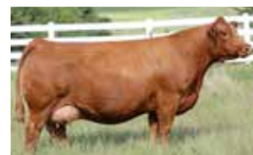
Dam - WFL Red Sage 506C