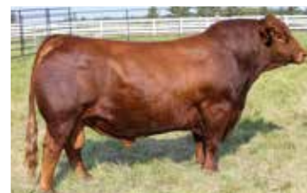
Sire - SVS Rancher 42H

LOT 57: The only direct Rancher son in the sale off one of our favorite donor cows Flirty. This guy is a big footed, long bodied, big boned bull with tons of hair and presence. He's really good on the move and check off lots of boxes like his dam. His dam is a favorite around here as she expresses a super prolific look that is unmatched with foot and udder quality that is next to perfect. She stems back to the great Certainly Flirtin cow family so maternal strength is very strong in this pedigree, especially when you add another great cow family like Sammie to the equation. Here's a bull that has all the right pieces and is definitely one that shouldn't be overlooked.