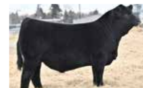
WF Capital 164L = Full Brother