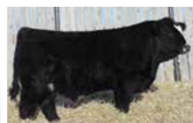
Maternal Brother W2 Southside