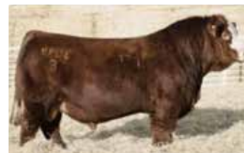
Sire - LFE Stratton 3094F