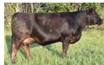
Dam - WF Blackgold 7G

CE BW WW YW MILK MCE MWW API TI 9 2.9 75.4 114 17.4 5.9 55.1 101.23 67.7