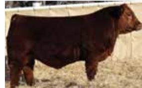
Maternal Grandsire - Wheatland Rival

When we first saw the Chaos bull we liked him a lot, but to be honest we weren't sure he would calve like his numbers said he would. He did and we would still be using him on heifers if we could. Out of a first calf Rival daughter comes the 31K bull and he is built much like the other Chaos bulls. Ample