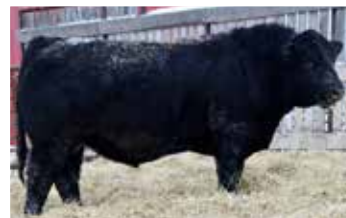
Maternal Brother - W2 Hellcat

LBR CROCKET R81 S: SKORS CROCKET 250F SKORS MRS DASH 94W