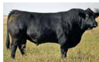
Maternal Grandsire - WFL Absolute 51Y

LBR CROCKET R81 S: SKORS CROCKET 250F SKORS MRS DASH 94W WFL ABSOLUTE 51Y D: W2 AUGUST NIGHTS 705E W2 AUGUST NIGHTS 503C