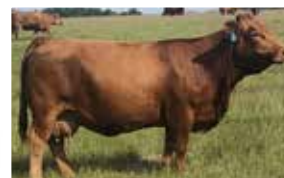
Dam - Erixon Lady 27Z

One of the hairiest bulls in the offering out of an Erixon cow that has put a lot of bulls through the bull pen and heifers in the replacement pen. This was her 10th calf born on our place so you could say she has earned her keep.