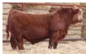
Sire - WF Warzone 153L

Here's a real angular, big bellied, extremely stout bull that is very fluent on the move and super complete. He's really nice in his hip shape and overall dimension with a big old top on him. His dam is a super complete, awesome uddered cow with perfect feet. His sire LFE Warzone had alot of great ones in the bull pen last year and he definitely didn't miss this year. 153L and his dam went to a few pen shows this summer and found some friends at them. This is a real complete herd bull in the making.