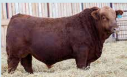
$13,500 - R Plus Simmentals