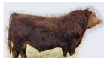
Sire - Skors Crocket 250F