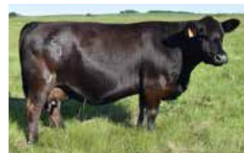
Dam - Mader Blackgold 45D

RF CAPACITY 742E S: RF MAGNITUDE 1178J RF FLIRT 434B