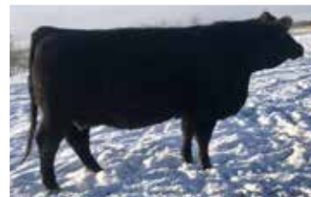
Dam - RF Miss 607D

LFE TRIUMPH 816A S: LFE STRATTON 3094F LFE RS AMBER 2140B SVS CAPTAIN MORGAN 11Z D: RF MISS 607D NCD MS FULL DREAM 50A