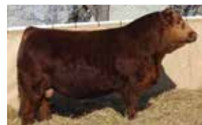
Sire - Wheatland Chaos 9145G

A ¾ brother to the Lot 8 bull out of one of these good young Rival daughters. The 024 cow is one of my favorite young cows as far as phenotype go. Very good uddered, big chested and like the dam above has went 2/2 in putting calves in the keeper pen. We think all