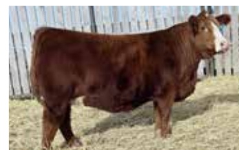
Full Sib - W2 Pocahontas