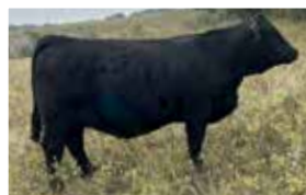
Maternal Sister - W2 Stella

The Epic sired dam is moderate framed and our kind of cow. The High Stakes bull bred very well for us and will leave a lot of females in our herd if the first year is any indication.