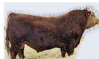
Sire - Skors Crocket

LOT 38: The 63K bull does a lot of things right. The way this bull gets out and travels and hold himself together so well is truly impressive. Like his half brothers ample rib shape, that added muscle and a bull that should calve well with his tucked in shoulders and excellent skull shape. Coming from an Absolute cow who we rank pretty high in our black program. The Absolute daughters are like peas in a pod. It's actually pretty hard to tell them apart without seeing a tag.