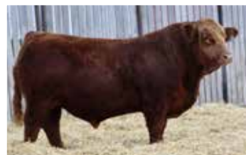
Full Sib - Lot 1

MAR MAC UTAH WHISKY 52E S: WLB TOP TIER 456G WLB 47Y FAE 343E IPU LIEUTENANT 24E D: IPU 10D POCAHONTAS 56G IPU 105L POCAHONTAS 10D