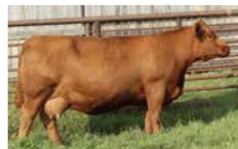
Dam - IPU 10D Pocahontas 56G