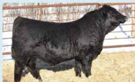
$16,000 - Double RN