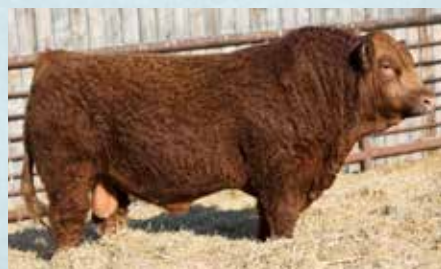
$11,500 - MJM Enterprises