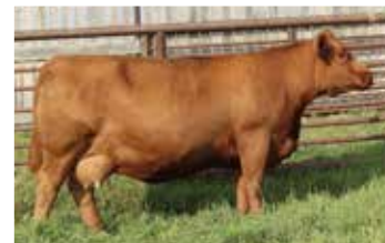
Dam - IPU 10D Pocahontas 56G