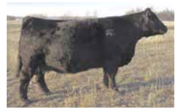
Dam- RCR Flirty Magilcuty 7D

LOT 40: Here's the natural calf of our Flirty Magilcuty donor who has done so many great things for our program. 65K was actually a twin to another bull, but his brother suffered an injury to his backend or they would both be going through this sale as they were very, very similar. 65K is sired by the Kingdom bull who commanded $26,000 the year we sold him and we decided to breed a few cows of our own to him. 65K is a moderate heavy muscled bull who looks like a herdbull. Again, if you want a big time cow to back your herdbull then you may want to have a look here.