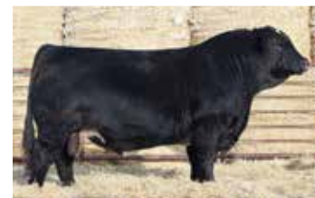
Sire - RF Magnitude 1178J

CE BW WW YW MILK MCE MWW API TI 7.8 2.9 69 101.5 20.4 4.6 54.9 102.8 65.28