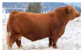
Sire - Mader Walk The Line 92J

A big time performance red bull that expresses tons of power, middle and dimension. This guy is big boned, massive hiped with tons of muscle shape. His dam is one of the most famous cows in the industry and she is a big time power cow. Udder and foot quality runs deep in this pedigree and bringing the $280,000 Walk the Line into the equation makes it even more exciting. This guy is a real powerhouse and he has a real neat herd bull look to him.