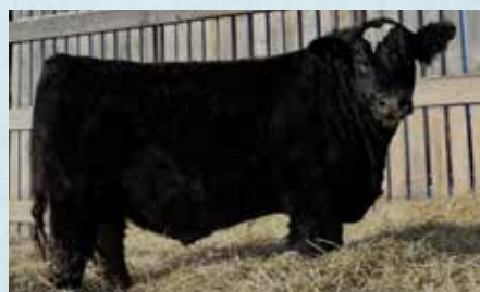
$13,000 - Ruzicka Farms