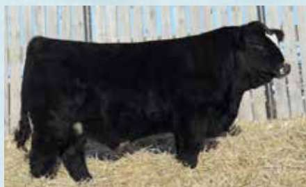
$48,000 - Deeg Simmentals & Canadian Sires