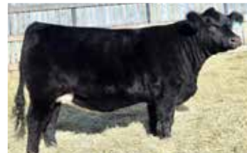
Maternal Sister - W2 Cream Soda

LBR CROCKET R81 S: SKORS CROCKET 250F SKORS MRS DASH 94W