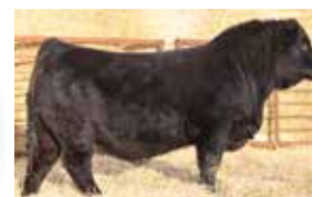
Lot 51 - WF Caliber 165L