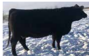
Dam - RF Miss 607D

LFE TRIUMPH 816A S: LFE STRATTON 3094F LFE RS AMBER 2140B