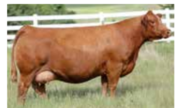
Dam - WFL Red Sage 506C