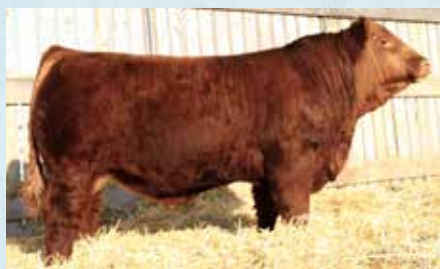
$14,000 - W2 Farms