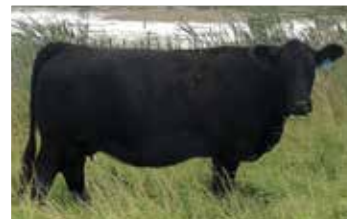
Dam - W2 Your Dream 611D

LBR CROCKET R81 S: SKORS CROCKET 250F SKORS MRS DASH 94W