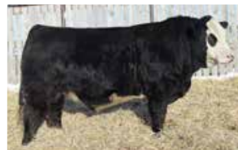
Paternal Brother - W2 Blackhawk

WS EPIC EI52 S: WHEATLAND CHAOS 9145G WHEATLAND LADY 913W