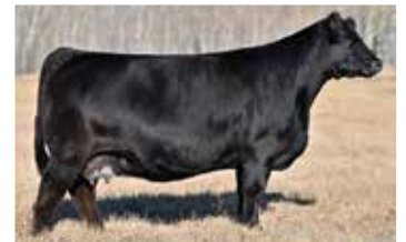
Full Sib to Dam - W2 Flirty 07H

WS EPIC E152 S: WHEATLAND CHAOS 9145G WHEATLAND LADY 913W