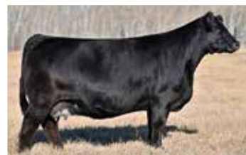
Dam - W2 Flirty 07H

SVS TYCOON 841F S: SVS RANCHER 42H HLTS SAMMIE