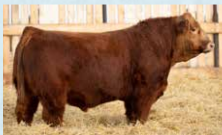
$18,000 - Ruzicka Farms