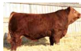
Paternal Brother - W2 Bad Blood

I probably sound like a broken record talking about adding frame and pounds to the calf crop, but this is another one of these Rivals that should do that. Long spined, added bone and dark red color are what would describe this guy best. For how good the WW and YW numbers are on all these Rival sons they sure have calved well for us through the years and that's why he has been used so heavy in our program.