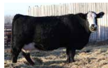
Dam - WTZ Abby 807F

LOT 42: Our lone black yearling bull, but he's a good one. Out of High Stakes our new Betts x Soda Pop 417B herdbull who came from Wallgren Farms. The cow behind him is the 807 Abby cow who has put 2 bulls through this sale including the red blazed bull yearling last year. She is a cow we are very high on and expect big things from her in the future. Lincoln 6L is a heavy haired, big hipped bull who has had "the look" from a very young age. A bull we think will be very popular come sale day.