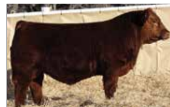
Sire - Wheatland Rival 8125F

LOT 10: The 66K bull comes from one of our favorite power cows on the place. Large framed, big footed and dark red would describe both the 66K bull and his momma. A bull that we think will add pounds to that calf crop and like we mention over and over it's the pounds that pay! The Rival bull himself was larger framed and is still walking to this day at 7 years old and is as sound as the day he showed up at W2.