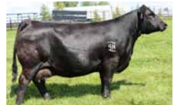
Maternal Grandam - HPF Cream Soda 248D