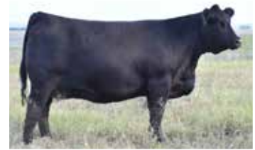
Dam - NGDB Cream Soda 347J

NCB COBRA 47Y S: MADER WALK THIS WAY 224B MADER P IRON SUGAR 7X