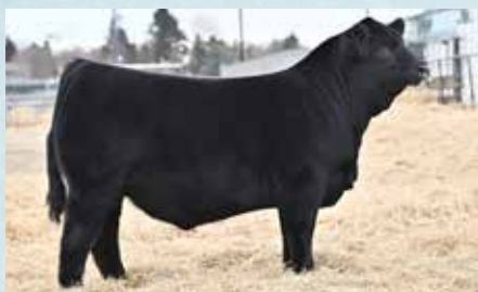
$240,000 - Double Bar D Farms