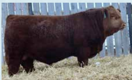
$20,000 - Westman Farms & JK Bar