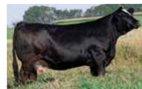
Dam - RF Sheila 023H