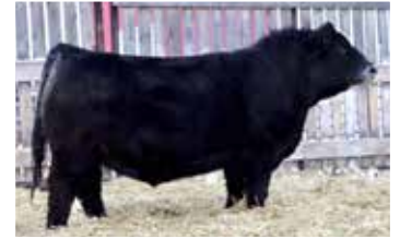
Maternal Brother - W2 Kraken

R PLUS SWAYZE 7083E S: W2 KINGDOM 5H RF MISS 607D