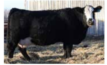
Maternal Grandam - W2 Abby 807F

WS EPIC E152 S: WHEATLAND CHAOS 9145G WHEATLAND LADY 913W