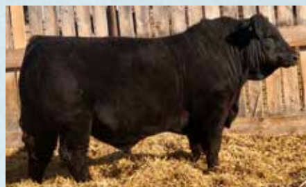
$26,000 - Westman Farms