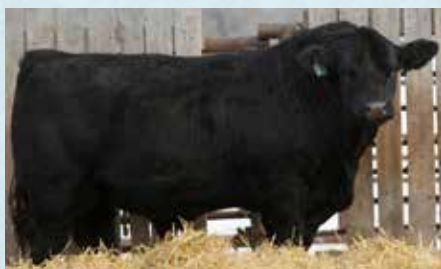
$15,000 - Swanz Ranch