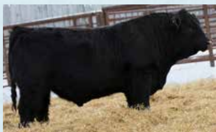
$13,500 - Gold Ridge Farming