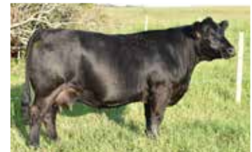
Dam - WF Shameless 8G

LOT 50: 149L has been a favorite in the pen all year and is admired for his extra length, frame, perfect hair, and huge middle. This bull is really good on the move and super flexible in his stride. Structural soundness is very important to us and I think this guy is a perfect example of just that. His dam is an awesome uddered, big time power cow that stands on a big square foot. She has raised 3 bulls for us now and she has never failed to rip out a good one. Her son last year which is also a full sib to 149L was our high seller to Clifford Land and Cattle and Rancier Farms for 24,000. The groundwork is done here and the potential in this guy is exciting to say the least.