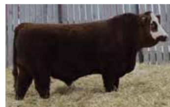
Maternal Brother = W2 Freeway

KWA LAW MAKER 59C S: DOUBLE BAR D LIBERATOR 412E DOUBLE BAR D GALAXY 101X RU TRADIN PAINT 2Y D: W2 BEHAVING BADLY 415B NORTH HILL SAMMY 69S