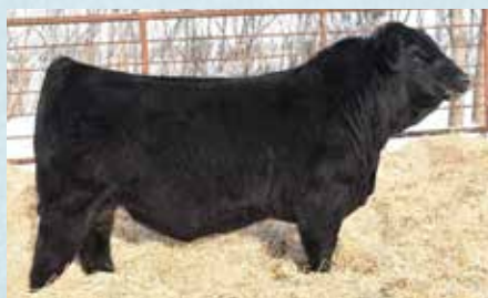
$12,000 - 4G Wild Farms