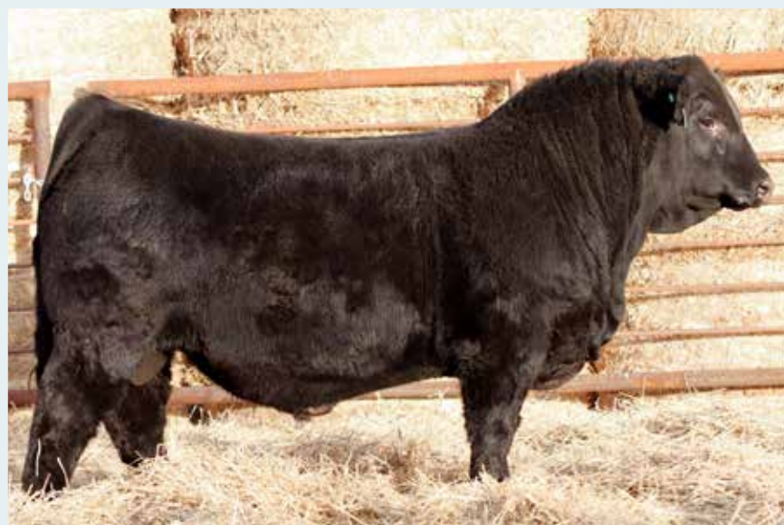
LOT 51 WF CALIBER 165L Homo Pld Hetero Blk /// WF 165L /// BPTG1432608 /// 4/2/2023

IPU BENTLEY 81F D: RF SHEILA 023H RF SHEILA 7105E