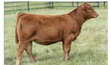
Maternal Sister - W2 Felipa 301L

CCLT ALLIANCE 91C S: WHEATLAND RIVAL 8125F WHEATLAND LADY 5213C