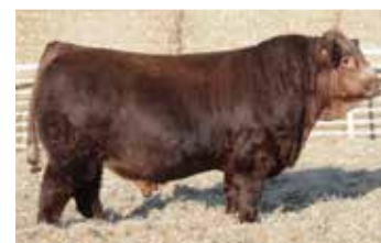
Sire - LFE Hall Pass 851G