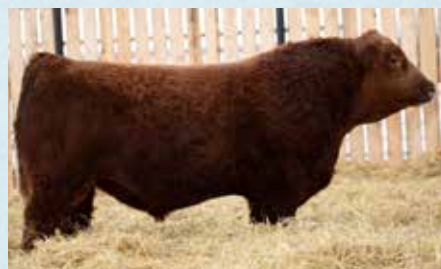
$13,500 - Ruzicka Farms