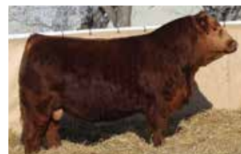
Sire - Wheatland Chaos 9145G

LOT 5: The Chaos sire group produced a couple of our top bulls last year and this year is no different. Bulls that we feel are perfect for the commercial cattlemen. Chaos was bought to be a heifer bull and he did that for 3 years for us and would still be doing it if he hadn't grown into such a massive powerful herd bull. We liked his first set of calves at such an early age that we bred him his second year to a handful of cows also. This was the result. The 23K bull has that added frame that comes from his Liberator sired dam. The Liberator bull left us some really good females who flat out produce.