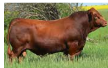
Sire - Double Bar D Liberator 412E

LOT 39: If you came for a blazed face bull this is your only chance in the black 2 yr old pen, but we think this bull has a lot more to offer then merely a beautiful blaze. As deep a bull as you will find in this sale and if you ever had the chance to see his sire Liberator walking at our place you would know where he gets it from. Soft made, easy doing and out of a real consistent cow make 78K a real interesting herdsire prospect. This is the last year we had the Liberator bull and he bred very well for us, our last 2 high selling red 2 yr olds were Liberators and I believe this is the only black Liberator we have ever offered.