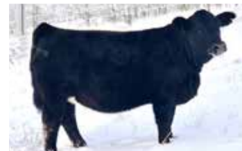
Maternal Sister - W2 Yara

CCLT ALLIANCE 91C S: WHEATLAND RIVAL 8125F WHEATLAND LADY 5213C