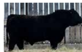
Maternal Brother - W2 Diplomat

size if you want to bring that up. All of these Rival bulls seem to have a real good foot under them. Rival himself has never had his feet touched which is rare it seems for a 6 yr old bull.