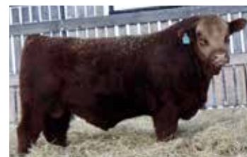
Maternal Brother - W2 Buckeye

CCLT ALLIANCE 91C S: WHEATLAND RIVAL 8125F WHEATLAND LADY 5213C