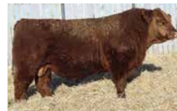
Maternal Brother - W2 Marino

LOT 25: The 53K bull comes from a cow we purchased out of the Maxwell program. She's dark red and deep chested all while carrying that calving ease pedigree of Circle G Cash. Dark red, hairy and again bigger framed would describe this bull best. The dam is a cow that we have high hopes for in the future as she really is a beautiful phenotyped animal.