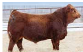
Maternal Grandsire - Double Bar D Liberator

WS EPIC EI52 S: WHEATLAND CHAOS 9145G WHEATLAND LADY 913W