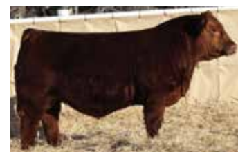
Sire - Wheatland Rival 8125F

CCLT ALLIANCE 91C S: WHEATLAND RIVAL 8125F WHEATLAND LADY 5213C