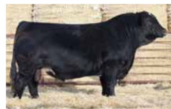
Sire - RF Magnitude 1178J

LOT 56: A real nice Magnitude son that goes back to one of the first purebred cows we purchased. Here's a real big hipped, soft made, big boned bull, with tons of middle, with just a moderate BW. A favorite Magnitude son in the pen that has had that herd bull look from a young age. His Captain Scream dam is one of our favorite daughters from the original 6C cow. We have a maternal sister to 162L that is soon to calve udder quality looks incredible. Maternal strength is very strong in this pedigree and we think quite highly of this individual.