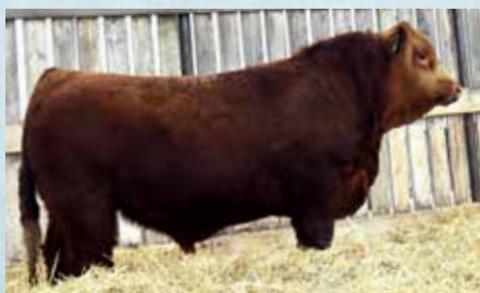
$12,500 - W2 Farms