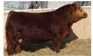
Sire - Wheatland Chaos 9145G

LOT 31: Homegrown 44K comes from one of the up and coming cow lines on the farm. This bull's mother would be a granddaughter of the Lot 30 bull's dam. She's a young Swayze daughter who knows how to raise a calf. In her first try she brings you this stud who we are confident will be one of the heavy weights come sale day. These Chaos bulls were popular last year and we think will be no different this year. Some calving ease mixed with some performance isn't always the easiest thing to accomplish, but that is exactl what we think you will find from this sire group.