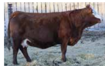
Dam- Redrich Dreamer 195G