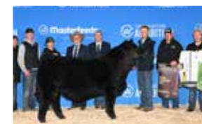
WF Capital 164L = Full Brother