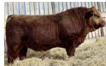
Maternal Brother - W2 Binge

CCLT ALLIANCE 91C S: WHEATLAND RIVAL 8125F WHEATLAND LADY 5213C