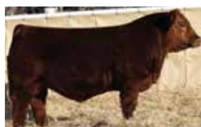
Sire - Wheatland Rival 8125F

one of the bigger framed cows in the herd and she goes back to the Teddy bull we used years back who left us a tremendous group of females.