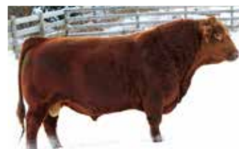
Sire - WHF Limitless B011

LOT 4: Our loan Limitless bull who we used on some red heifers for a couple years and has been very popular in the industry as an AI sire. This guy came out a modest 78lbs and from a very young age got that herdbull look to him. We sold a maternal sister to 1K last fall to Cache Schiller who we really admired for her stout build. The 040 cow herself is a moderate Liberator daughter who has a picture perfect udder who seems to have a knack for sending calves to the replacement pen in her first 2 tries.