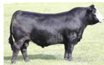
Maternal Grandsire - R Plus Swayze

LOT 6: A Chaos son with that valuable white stripe on his face out of one of our good young Swayze daughters. We have sold a lot of Swayze sons the past few years of our sale, but in our minds his greatest accomplishment was the set of females he left behind. The 42K bull himself is a stout made bull who comes to us in a moderate package. A bull that as a calf beside his first calf heifer were quickly picked out in the pasture and we believe his dam is just getting started. We think this bull has the build and pedigree to calve well.