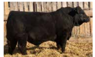
Sire - W2 Kingdom 5H

LOT 41: Here's an unregistered son of the Kingdom bull, but a bull that has a lot to offer the commercial cattleman. Heavy haired, a big old foot and a lot of length of spine are just a few of the reasons this bull has really caught our eye these past few months. A bull that really has taken off since early December and one that we think will be hard to miss come sale day. He is actually backed by an ET cow that goes back to our Licious Donor cow and sired by the 680S bull who needs no introduction to the industry.