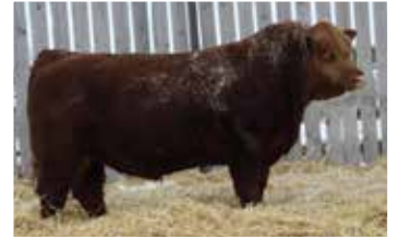
Maternal Brother - W2 Fury

CCLT ALLIANCE 91C S: WHEATLAND RIVAL 8125F WHEATLAND LADY 5213C