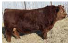
Maternal Brother - W2 Breakaway

that are just getting started and we think you will see his pedigree through our catalog for a lot of years. The 19K bull himself has been one of the favorites of this sire group from a young age. Out of a young Shear Force cow who is moderate in frame and weans off a big calf each year.