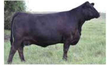
Dam - WF Blackgold 42H

RF CAPACITY 742E S: RF MAGNITUDE 1178J RF FLIRT 434B