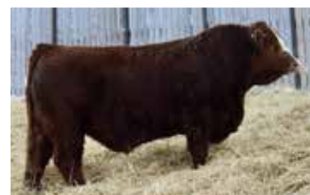
Maternal Brother - W2 Patrol

LOT 28: A Crocket bull who is deep red with that popular baldy face. Putting this cow on a group of solid red Angus based cows we think would really click and add little frame and punch to that calf crop. The 640 cow is colored very similar to this bull and a cow that has put a couple sons prior through our sale.