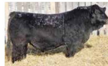
Maternal Grandsire - MAF Drunken Sailor