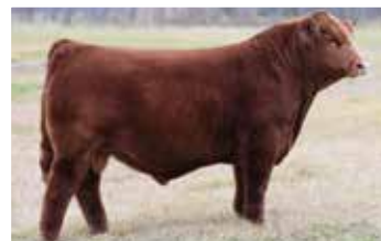
Maternal Grandsire - Captain Scream

LBR CROCKET R81 S: SKORS CROCKET 250F SKORS MRS DASH 94W