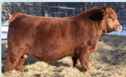
$24,000 - Westman Farms & W2 Land & Cattle