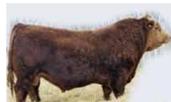
Sire - Skors Crocket 250F

LOT 36: A personal favorite of ours for his overall dimension and depth of body. Low set, muscular and with that herd bull look. 43K comes to us from the Crocket bull and out of a really good Upgrade cow. She consistently puts a bull through the sale or a heifer in the replacement pen and one of our favorite young black cows would be a direct daughter of 611D. Our idea of an ideal herd bull prospect is 73K.