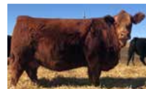
Maternal Sister WTZ 627B