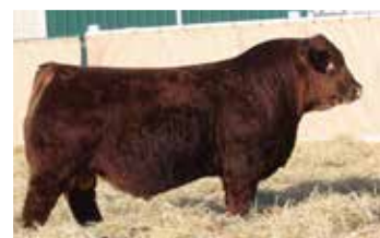
Paternal Brother Wheatland Next Century

LOT 26: Following in foot steps of many of this sire group another large framed Rival son who should push the scale down come sale day. Dark red out of a large framed Royal Red daughter comes this herdbull prospect. Believe me when I say bringing along these extra age bulls isn't always fun and a lot of time, money and energy goes in to getting them to sale day, but we believe in the benefits of this extra age deal and that's why we do it.