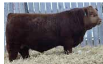
Paternal Brother = W2 Cardinal Red

LOT 24: W2 Arrival 47K is quick to be picked out of the pen and for good reason. As you can see in his picture he's such a balanced bull, with that great haircoat in what we think is an ideal frame size. With the 84 lb birthweight we think he should calve really well. An ideal bull to make those hairy steer calves that have some jam to them. We think the cattle buyers would be licking their lips looking at a ring full of calves from this stud.