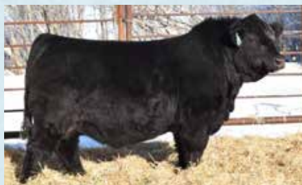
$24,000 - Clifford Land & Cattle & Rancier Farms