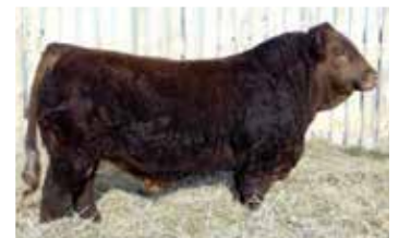
Maternal Grandsire - SVS Brooks 669D

LOT 22: The 12K bull comes from a female we purchased a few years back out of the Friday Night Lights Sale with my brother Trent from MAVV Farms. She is a big powerful Brooks daughter who has worked very well for us. We sold a maternal sister to this bull last summer in the Bohrsen Family Matters Summer Sale to W Sunrise and she was well received. 12K himself is dark red and again larger in frame and a bull that we think should again sire that heavy pen of steers all the buyers are looking for.