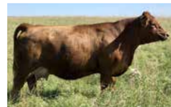
Dam - W2 Yara 329F