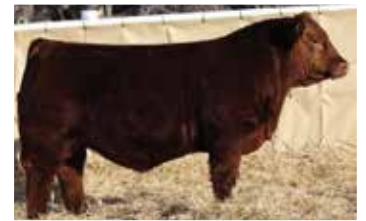
Sire - Wheatland Rival 8125F

LOT 21: These good Rival sons keep coming with WTZ 20K. Backed by a Mountain female who was our go to calving ease bull for many years. For 2 years in a row Mountain sired bulls were our largest sire group and that doesn't usually happen with a calving ease bull. With the large number of calves he left here in turn meant a large number of females that are in production here. All great uddered cows that are moderate in size. The 20K bull himself fits the mold of these Rival sons with a little added length and dark red in color.