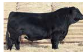
Sire - RF Magnitude 1178J

Here's a dark cherry red bull that has tons of muscle shape and is explosive in terms of power and is a very complete package. He's a good footed, hairy, soft made bull that stems back to the nice Blackgold cow family that has worked well in our program. His dam was purchased in Friday Night Lights sale a few years back and she is very good, honest cow that goes back to Westcott x 2022. 168L is sired by our new herdbull RF Magnitude that we are really high on and has really impressed us with his first calf crop. A solid pedigree stemming back to strong cow families.