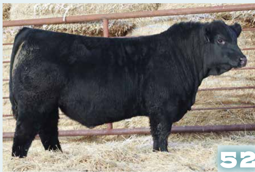
LOT 52 WF CALIBER 160L Homo Pld Hetero Blk /// WF 160L /// BPTG1432606 /// 29/1/2023