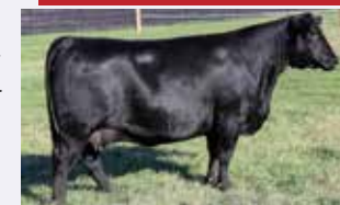
DAM - LINZ LADY BLASTER 453-9202

SIRE CONNEALY PAYRAISE CRAWFORD GUARANTEE 9137 CRAWFORD MS ARMORY D40