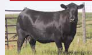
DAM - PEAK DOT MIA 247C

S A V RENOVATION 6822 BROOKING EMERALD 9179 BROOKING BEAUTY 6051