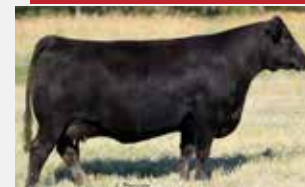
GRANDAM - WERNER BLACK ANGEL 1299

S A V RENOVATION 6822 BROOKING ROSEWOOD 0158 BROOKING ROSE 7027