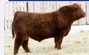
FULL SIB - ANCHOR B JACK DANIELS

SIRE B BAR AUSTIN HEALY 4D ET ANCHOR B GOLD RUSH 48G ANCHOR B BAILEY 21B