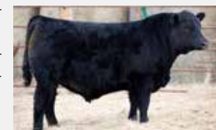
MATERNAL BROTHER - ANCHORAGE VIRTUE 9082

» EXAR Blackbird 4069 has been a great producing female with sons to J.E. and daughters retained in herd. She is a beauty of a female and one that we are building around going forward as she is in our summer calving program and is the real deal » Stadium is an impressive individual with hair, length, shape and overall balance throughout » Ozark is a strong breeding bull and one that we can recommend to utilize in the most progressive programs