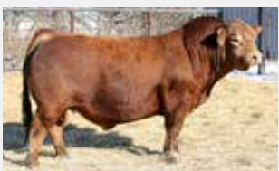
SIRE - B-BAR STETSON 35H

» Kingsway 80K is a coming two year old Stetson son who will cover a group of cows. He is homo polled and comes from good milking dam with longevity. He will provide some length of body to his calves and that Limo muscle we are always looking for.