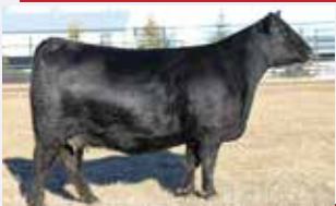
DAM - LINZ LADY CHARM 62137-9916

SIRE S A V RENOVATION 6822 BROOKING EMERALD 9179 BROOKING BEAUTY 6051