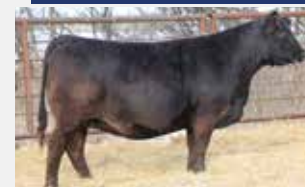
DAM - JYF EMOTION 30E

SIRE IVY'S BUBBA WATSON HTZ24B B BAR AUSTIN HEALY 4D ET B BAR POLLED UNIQUE