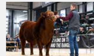
SIRE - B-BAR/VLE SAMURAI 117J ET

» Levi is sired by the 2022 Farmfair Champion Limousin bull who has become our Senior Herdsire at Anchor B. Samurai is siring long spined, performance based, attractive calves and Levi is no exception.