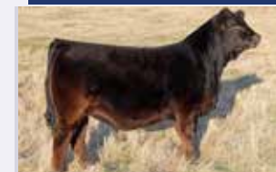
DAM - GREENWOOD GALAXY 49G

SIRE TOMV DIESEL 619D TREF HARDCORE 204H TREF DELANEY 204D