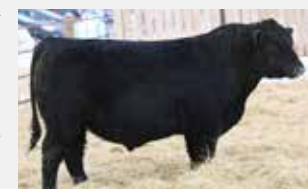
MATERNAL BROTHER - ANCHORAGE PATRIARCH 0210

» Volcom is fuzzy haired, long fronted, and extremely sound with longevity built into him » We can't say enough about the positive influence that Ozark has had on our program and it is bulls like this and the daughters who are flat out impressive. We had the pleasure to flush Ozark dam in partnership with Peak Dot and she is a very good looking, powerful cow and is another prime reason on why he worked so well here » A maternal brother, Patriarch was a past sale feature to Sundry Acres and 172F just does not miss