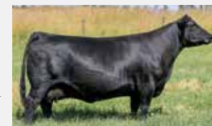
GRANDAM - BROOKING ROSE 8180