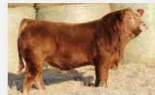
SIRE - B BAR AUSTIN HEALY 4D ET

» Lebron 17L comes from a deep bodied JYF cow & the proven B Bar Austin Healy (sire of Anchor B Gold Rush). 17L is well balanced, deep made & will service cows well.