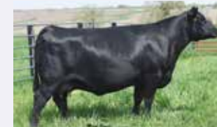
DAM - S A V MADAME PRIDE 1282

SIRE CONNEALY EARNAN 076E BROOKING BANK NOTE 4040 E A ROSE 918