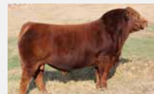
SIRE - B-BAR/VLE SAMURAI 17J ET