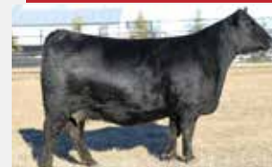
DAM - LINZ LADY CHARM 62137-9916

SIRE BROOKING FIREBRAND 6068 BROOKING THE DUKE 0186 S A V DUKE GIRL 8161