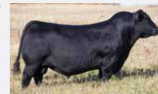
SIRE - BROOKING BANK NOTE 4040