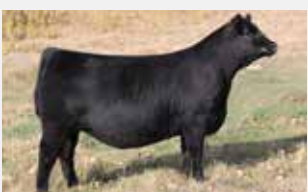
MATERNAL SISTER - ANCHORAGE LADY CHARM 1916