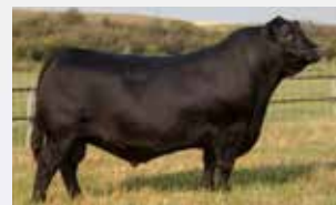
SIRE - BROOKING EMERALD 9179