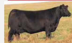
GRANDAM - PEAK DOT HEROINE 330B

SCHIEFELBEIN ATTRACTIVE 4565 PEAK DOT OZARK 278G PEAK DOT HEROINE 330B