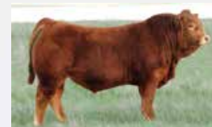
SIRE - TREF HARDCORE 204H

» Lexus 32L is a bull we appreciate for his softness, muscle shape & hair. He is free moving, and commands attention. Ranking in the top 3-4% of the breed for WW, YW, and Total Maternal we are impressed what 32L has to offer. Sired by the $51,000 TREF Hardcore and out of a beautiful Greenwood Electric Impact daughter; we feel Lexus 32L will sire calves that will add pounds & muscle to your bull calf crop, while maintaining the style & shape we all look for in the replacement pen.