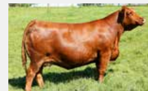
DAM - ANCHOR B BAILEY 21B