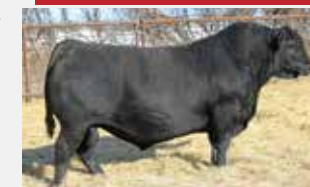
SIRE - PEAK DOT OZARK 278G

SIRE SCHIEFELBEIN ATTRACTIVE 4565 PEAK DOT OZARK 278G PEAK DOT HEROINE 330B