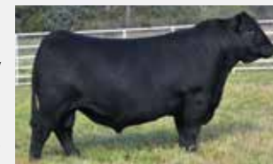
SIRE - S A V BLOODLINE 9578