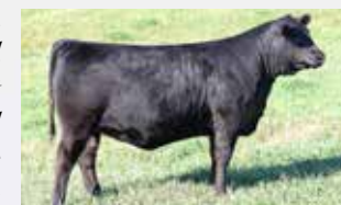
MATERNAL SISTER - ANCHORAGE LADY BLASTER 0444

» Riptide was featured in last year's sale and was a stud who created so much interest. Maybe it was all the interest he created and the nerves got to him but he unfortunately failed his semen test and we pulled him from the sale. He passed shortly after and we considered using him in herd but didn't and comes to you as a featured two-year-old » Incredible numbers and stacked pedigree as 9202 flat out produces and has a strong history of production » We feel Riptide puts it all together and is an obvious candidate to lead off the extra age section as he is a big time herd bull