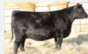
MATERNAL SISTER - ANCHORAGE QUEEN 9037

» 0313 will add length, playwright and overall dimension to his calf crop and put extra power into his calves