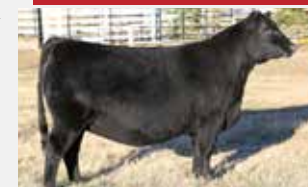
MATERNAL SISTER - ANCHORAGE ELLEN 0004

SCHIEFELBEIN ATTRACTIVE 4565 PEAK DOT OZARK 278G PEAK DOT HEROINE 330B