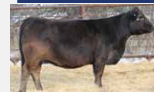
DAM - CLARKS GORGEOUS USHEILIA

SIRE B BAR WARHAWK 11G B-BAR/VLE SAMURAI 117J ET MISS TMF SHAMELESS