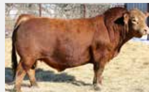
SIRE OF LOTS 24 & 25 B-BAR STETSON 35H

DAM ANCHOR B "THE BOSS" ANCHOR B CALLIE 15C TOP MEADOW 1P