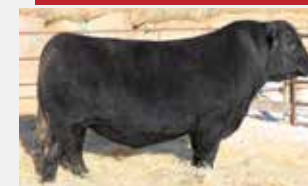
MATERNAL BROTHER - ANCHORAGE KINGSTON 1077

SCHIEFELBEIN ATTRACTIVE 4565 PEAK DOT OZARK 278G PEAK DOT HEROINE 330B