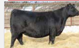
DAM - ANCHORAGE TIBBIE 0061

S A V RAINFALL 6846 S A V BLOODLINE 9578 S A V EMBLYNETTE 2369