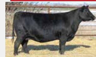
DAM - REMITALL F MISSIE 142E

S A V RAINFALL 6846 S A V BLOODLINE 9578 S A V EMBLYNETTE 2369