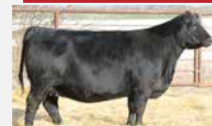
GRANDAM - CIRCLE G ERICA 856F

SIRE PF OKLAHOMA 6625 AMM STILLWATER 7H BROOKING ROSE 8180