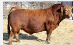
SIRE - B-BAR STETSON 35H