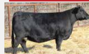
DAM - COUL LADY BLOSSOM 38'17

S A V RENOVATION 6822 BROOKING ROSEWOOD 0158 BROOKING ROSE 7027