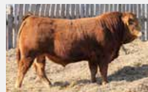
SIRE - B BAR BENTLEY 8D