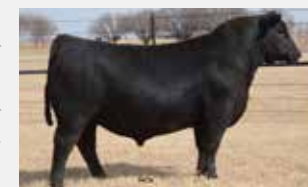
SIRE - PF OKLAHOMA 6625

» His sire, Oklahoma has done an awesome job in the industry and really worked here at Anchorage, he just seems that he doesn't miss for us » His dam, 195H was purchased in the Rose Bowl Event from the beauties up at Chatsworth and she has evolved into an awesome cow » This heifer bull prospect is loaded with maternal and will certainly do a job for you, especially if you retain females as this is a stacked pedigree here in this bull