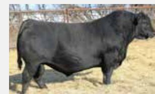
SIRE - PEAK DOT OZARK 278G