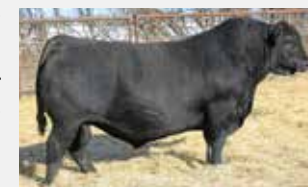
SIRE - PEAK DOT OZARK 278G

» A proven pedigree here with Ozark and the cornerstone 174Z behind him who has put sons into the Gehl Ranch » Muscle shape, balance and overall herd bull character is represented in 2099 as he is one of the really complete bulls in the offering » Use Callahan with confidence and utilize him throughout your program as we like him really good