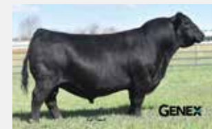
GRANDSIRE - KG JUSTIFIED 3023

» A heifer bull prospect and a true sale feature at that. » Outcross yet proven pedigree in 3035 as Profound x Justified is a very strong calving ease pedigree » His dam, 20H sold to the good people at LA Ranch in BC as they truly put together some awesome cattle » We are really high on this hairy, soft, smooth made individual that is so well balanced throughout