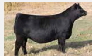
MATERNAL SISTER - ANCHORAGE LADY CHARM 1916