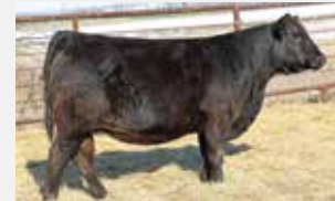
DAM - DC JOLIETTE 116J

SIRE RPY PAYNES CRACKER 17E B-BAR STETSON 35H B BAR KARISMA 57E