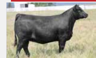
DAM - CHATSWORTH ANNIE F 195H

V A R DISCOVERY 2240 PF OKLAHOMA 6625 PF 5682 HENRIETTA PRIDE 0533