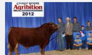
GRANDSIRE OF LOTS 24 & 25 ANCHOR B "THE BOSS"

DAM ANCHOR B "THE BOSS" ANCHOR B BLACK LACE 31B ANCHOR B ZIPPER