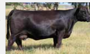
GRANDAM - TLA BEAUTY 5R

» The dam is a big time donor for us and one that we are going to build around with confidence. Coleman Beauty 058 is a maternal sister to Soo Line Motive and she is a prominent donor female for Canadian Donors that is the right kind with strong feet, awesome udder and angular made. » His sire, Sold Out was a high selling bull from Hamilton Farms that has left a strong group of sons and daughters equally » Strong EPDs, a great pedigree and a good looking dude is wrapped up in this very complete bull