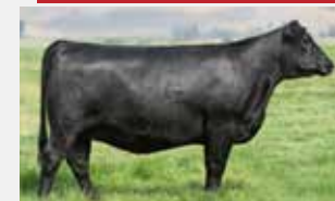
DAM - COLEMAN BEAUTY 058

SCHIEFELBEIN SHOWMAN 338 HF SOLD OUT 179J HF ROSEBUD 246Z