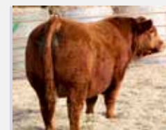
MATERNAL BROTHER - ANCHOR B GOLD RUSH