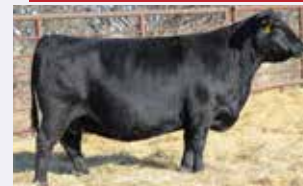
DAM - TJF BLACKBIRD 88E

SIRE SCHIEFELBEIN ATTRACTIVE 4565 JPC ATTRACTIVE 028H LAZY H BAR FOREVER LADY 317