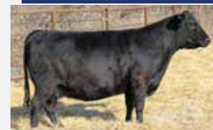
DAM - RIVERSTONE CHEERLEADER 9Y

SIRE B BAR WARHAWK 11G B-BAR/VLE SAMURAI 17J ET MISS TMF SHAMELESS