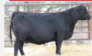
DAM - RRAR QUEEN 30D

S A V RAINFALL 6846 S A V BLOODLINE 9578 S A V EMBLYNETTE 2369