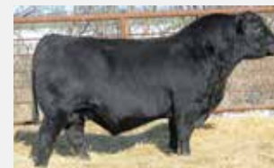
SIRE - BROOKING ROSEWOOD 0158

» His dam, 9026 was selected by Arley Cattle as a sale feature and goes back to one of the best cows we have ever been associated with, the famous Black Angel 1299