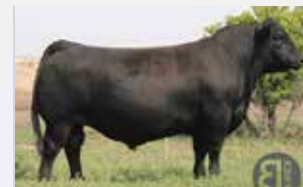
GRANDSIRE - SCHIEFELBEIN ATTRACTIVE 4565

» TJF Blackbird 88E was an up and coming cornerstone female in the December sale selling to one of the very best cattlemen in the business, the Oberle family. We have the utmost respect for them and when good cattlemen like the Oberles buy cattle such as his dam, you know you got good genetics behind this bull » 3001 is a different twist on pedigree and one that we truly think will be profitable to the new owners » Good growth and overall power here in a feature Attractive son