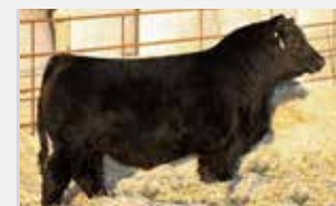
MATERNAL BROTHER - ANCHORAGE MISSOURI 1062

» Roster is a high quality individual and rightfully so with a pedigree that is flat out stacked up