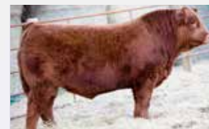
SIRE - ANCHOR B GOLD RUSH 48G