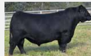
SIRE - S A V BLOODLINE 9578

» This hairy, soft and very complete individual is a sale feature and one we are proud of