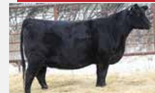
DAM - COVEY HILL MADAME PRIDE 20H

SITZ PROFOUND 680G HF INTIMIDATOR 15J HF TIBBIE 282A