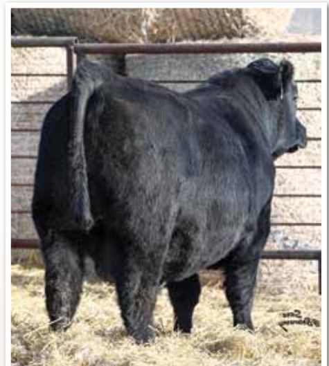
2301 - HIP