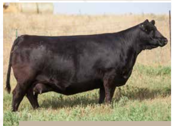
FULL SIB TO GRANDDAM BROOKING BEAUTY 333