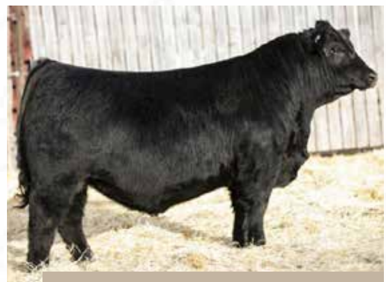
SIRE HF GRAVITY 313K

Lot 20 leads off a new sire group for us this year, and probably represents our HF Gravity 313K the best. Gravity was our pick from the 2023 Hamilton Farms bull sale. He quickly grabbed our attention and we felt fortunate to get him. He was the youngest bull in the sale and was penned with the big boys. His sons are the same here. They are born later, but are above pen averages for performance. Gravity is great footed and has a great look about him. 466 is certainly a pen favourite, he has an awesome head and skull, is deep ribbed and big hipped. He is high performing and should not be overlooked. It comes as no surprise on the female side. 712 hails from the beauty cow family and her dam would be a full sib to the infamous Brooking Beauty 333. She raises a top quality calf year in and year out and lot 20 is no different.