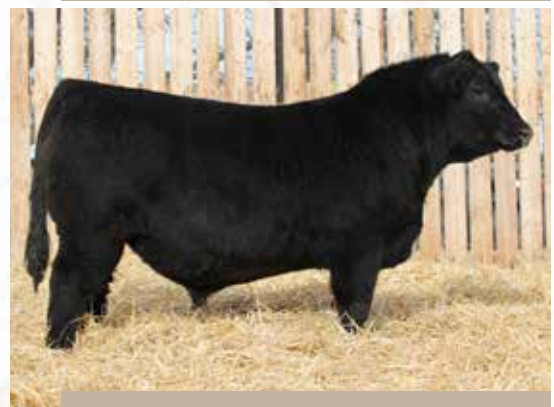
MATERNAL BROTHER RFA 366L