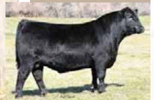
MATERNAL GRANDSIRE FF BLACK GOLD JF C19