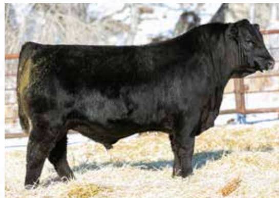
SIRE W SUNRISE EXECUTIVE LAW 737K

A big cool looking Executive law son, out of a moderate made heavy milking Heston daughter. This guys performance numbers are real special with a 78 lb BW and big weaning and yearling numbers. He certainly has a presence to him and offers a little something different in terms of pedigree for our customers. The Executive Law bull is another no nonsense type, and will be what guys are looking for.