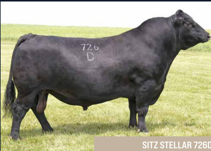
SITZ STELLAR 726D