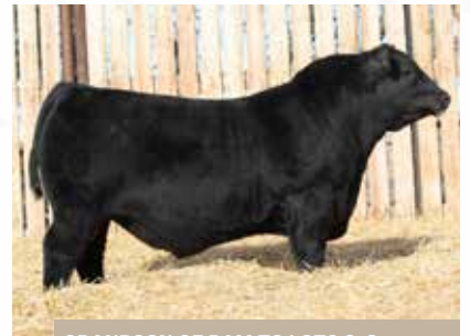
GRANDSON OF DAM TO LOTS 3-6 RIVERFRONT OAKLAND 330L