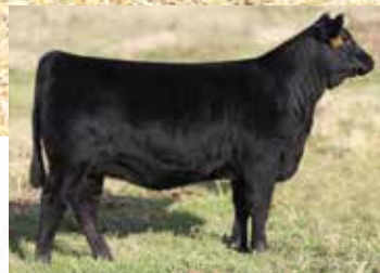
DAM BROOKING ROYAL LASS 313