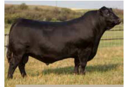
SIRE BROOKING EMERLAD 9179