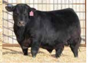
MATERNAL BROTHER RFA 320L