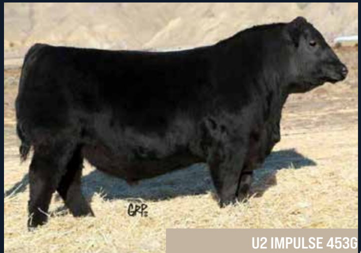
U2 IMPULSE 453G