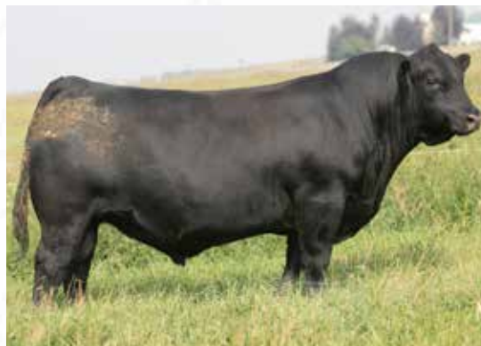
SIRE WILBAR MILESTONE 48J

In 2022, we were fortunate to find a neat and unique calving ease bull at Wilbar Cattle Co. We partnered with our friends at Westway Farms, and the bull has bred very well at both places. He is sure-fire on heifers. He is very good footed, has a ton of extension in his front 1/3, and his length of body is second to none. His dam is beautiful cow and one you would want a son of. 404 offers the same calving ease but yet performance maybe not expected out of his 2 year old dam. He is very balanced, wide topped, and sound. This bull has really come on lately and continues to get better and better. Definitely one of the better calving ease options offered.