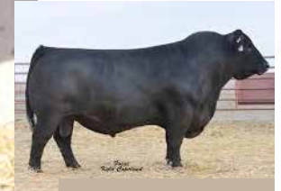
MATERNAL GRANDSIRE MUSGRAVE AVIATOR