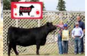
MATERNAL SIB TO DAM RIVERFRONT ANNIE K 119J