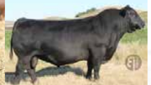
MATERNAL GRANDSIRE VISION UNANIMOUS 1418