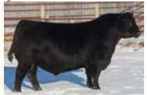
MATERNAL GRANDSIRE BROOKING FIREBRAND 6068