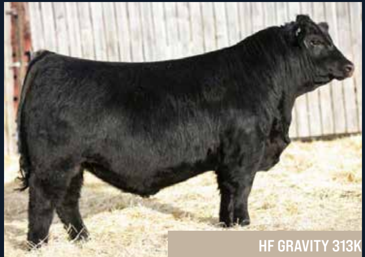
HF GRAVITY 313K