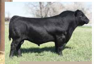
MATERNAL GRANDSIRE HA PRIME CUT 4493