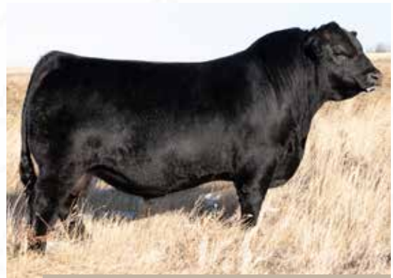
FULL SIB TO DAM EXECUTIVE DECISION

We once again start this years catalog off with the Brooking Emerald sire group. His progeny are in high demand and sons and daughters continue to top sale results. We are now calving out the first Emerald daughters and they have fantastic udder quality and mothering ability. Emerald will continue to play a large part in our program and we are excited for what the future holds. 430M is a bull that is maybe the most intriguing from both a phenotypic and pedigree standpoint. We purchased the dam from the exciting Poplar Meadows Dispersal. She is a direct daughter of the breed legend Bar-E-L Natural law and also would be a full sib to the popular sire PM Executive Decision. On his own right, 430 has been a favourite all summer long and has picked up another gear since weaning. He is extremely balanced and well put together. He is big crested, big hipped, and stands up with above average heel.