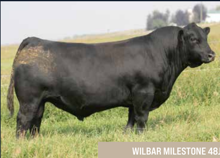
WILBAR MILESTONE 48J