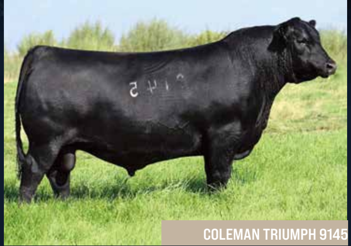
COLEMAN TRIUMPH 9145