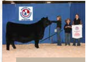
DAM BROOKING BLACKCAP 2216