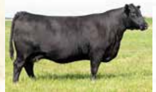
MATERNAL GREAT GRANDDAM CNC 43N