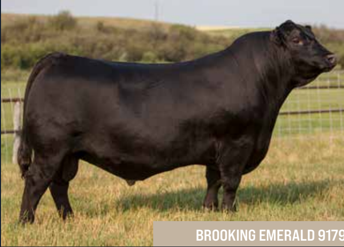
BROOKING EMERALD 9179