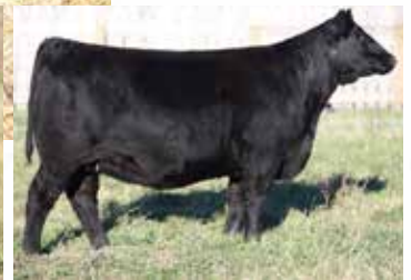
MATERNAL SISTER TO LOTS 9 & 10 RIVERFRONT ROYAL LASS 505C

lot 10 Riverfront EMERALD 446M PENDING | RFA 446M | FEBRUARY 7 2024