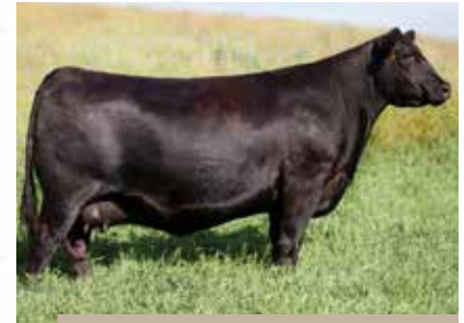
PATERNAL GRANDDAM BROOKING BEAUTY 6051