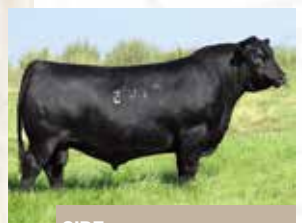
SIRE COLEMAN TRIUMPH 9145