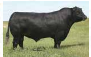
MATERNAL GREAT GRANDSIRE HF KODIAK