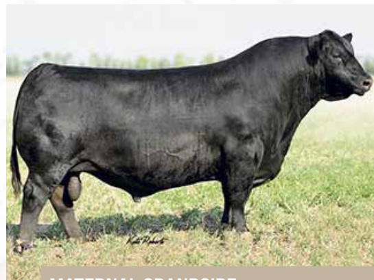
MATERNAL GRANDSIRE S A V HESSTON 2217