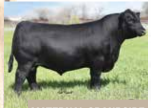
MATERNAL GRANDSIRE MUSGRAVE 316 STUNNER