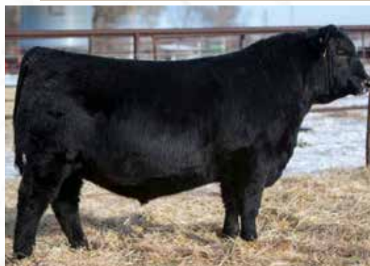
MATERNAL GRANDSIRE BROOKING RENOVATION 8099