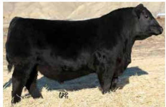
SIRE U2 IMPULSE 453G

The Impulse sire group has been around the last few years and has always been well accepted. We purchased Impulse for his phenomenal foot and calving ease. At 6 years old his feet are still perfect, he is a moderate made bull with a huge crest and expressive muscle shape. 443 is probably most like his sire. He is solid on the ground, extremely docile, and big boned. He is backed by one of our favourite cows on the place. 255F is big bodied, easy fleshing with outstanding udder quality. We have 1 daughter retained and sold feature bulls to WB Cattle Co and Erwin Schlenker Farms.