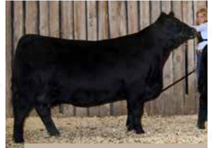
MATERNAL SISTER TO LOTS 3-6 RIVERFRONT ANNIE K 119J