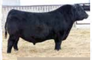
MATERNAL GRANDSIRE BROOKING MERCURY