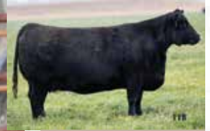
DAM BANDURA MISS MAYFLOWER 11E