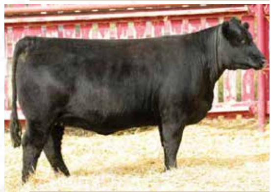
DAM PM BLOSSOM 90'21