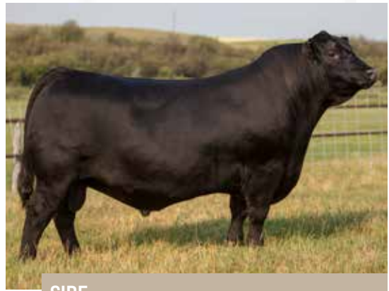
SIRE BROOKING EMERALD 9179

Coming in at Lot 2 would be the powerhouse bull from this year's calf crop. He is overpowering with as much rib, depth, and thickness as you can put into one. 426 was the #1 weaning weight bull we had and continued that right through to his yearling weight. We have calved a full sibling this year, and she as well is a tank of a heifer yet possesses an udder you would draw up. The dam 602 is 9 years old and has once again calved early. She is a big bodied female, with solid feet and a nice udder. She is backed by breed giants such as Sitz Upward 307R and HF Kodiak 5R.