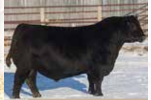
MATERNAL GRANDSIRE BROOKING FIREBRAND