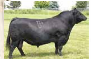
SIRE SITZ STELLER 726D