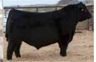
MATERNAL GRANDSIRE BROOKING FUTURES 8055