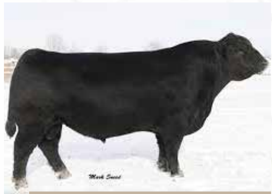
MATERNAL GRANDSIRE SITZ UPWARD 307R