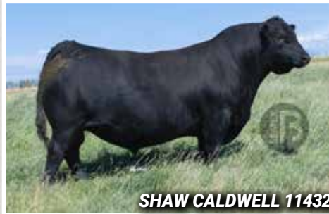
SHAW CALDWELL 11432