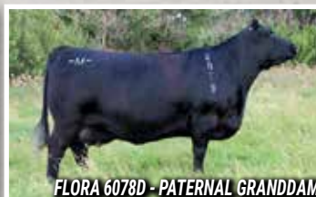
FLORA 6078D - PATERNAL GRANDDAM