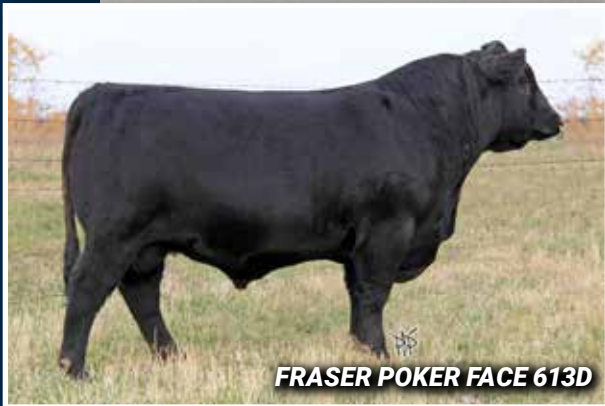
FRASER POKER FACE 613D