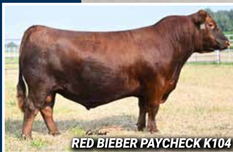
RED BIEBER PAYCHECK K104