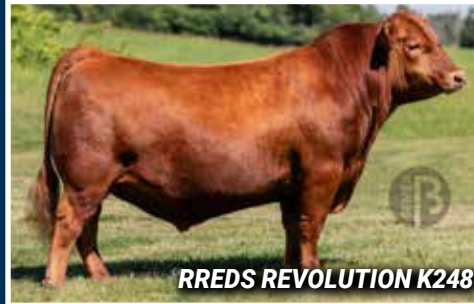
REDS REVOLUTION K248