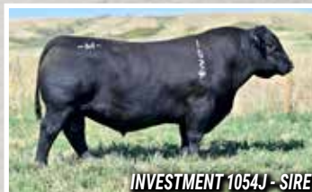
INVESTMENT 1054J - SIRE

Stemming from the legendary Bar-E-L program and harnessed with the power of the Duchess cow family who now reside at Murray Ranches that yield productive, efficient, low input cattle with eye appeal and natural stoutness. Sired by the highly sought after Merit Investment, whose offspring consistently rise to the top for structural correctness, udder quality and foot quality. Marquee is a bull right for the times. His hind leg, hip, presence, stature and ability to move have captivated cattlemen who have seen him.