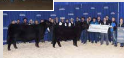
CREED DAUGHTER DMM BLACKBIRD 105A