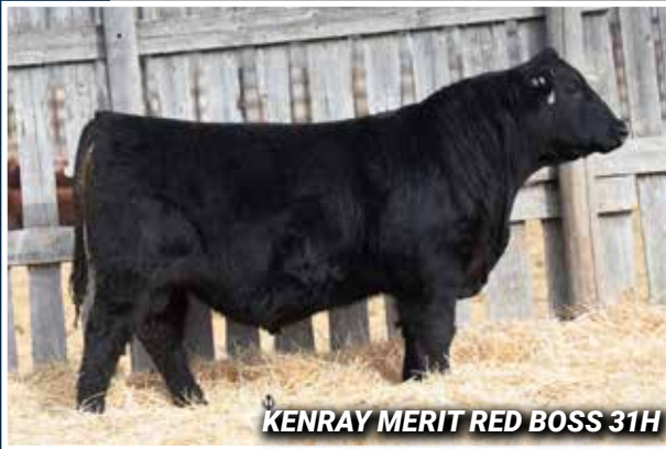
KENRAY MERIT RED BOSS 31H