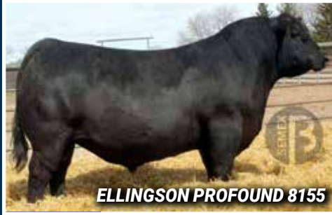
ELLINGSON PROFOUND 8155

Pick of any bull from the 2025 SEMEX BEEF INVENTORY