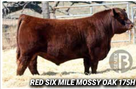
RED SIX MILE MOSSY OAK 175H