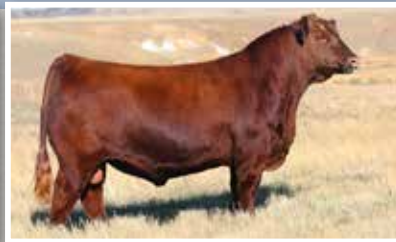
Red Six Mile John Wick 882E, full sib to pregnancy

RED BLAIRS Nice 25Y X RED Blairs Bings 581B