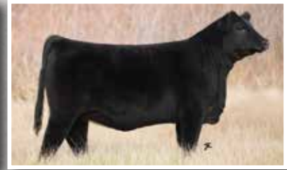
HLC CSI Erica 354M, daughter of 561G

BLAIRS Madame Pride 737G X RED DUFF HD 2046