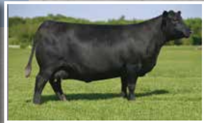
S A V Madam Pride 0151, Grand Dam

RED SIX MILE & CO Gloria 29A X RED U-2 Reckoning 149A