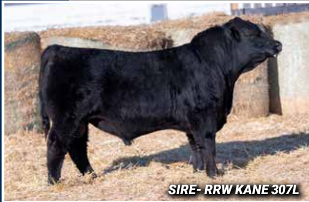
SIRE- RRW KANE 307L