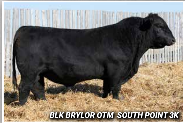
BLK BRYLOR OTM SOUTH POINT 3K