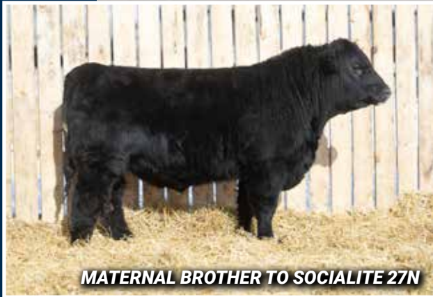
MATERNAL BROTHER TO SOCIALITE 27N