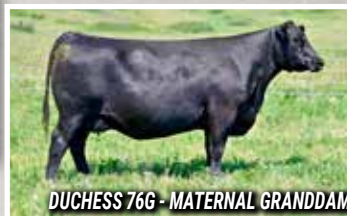
DUCHESS 76G - MATERNAL GRANDDAM