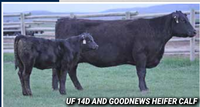
UF 14D AND GOODNEWS HEIFER CALF

1942121 UF 14D Jan 7, 2016 | 2406164 IMP 0275G Sept 4, 2019