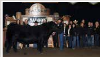
CREED SON DMM CREED 75W