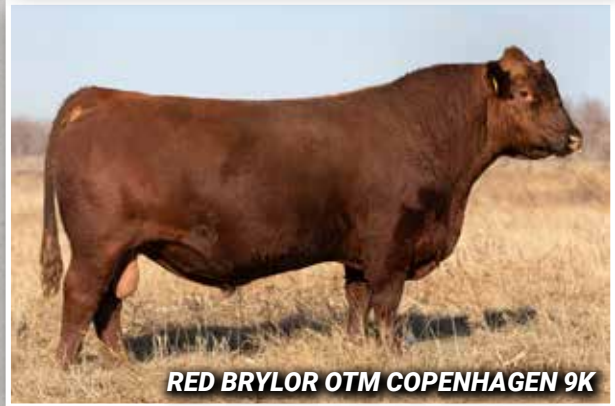
RED BRYLOR OTM COPENHAGEN 9K