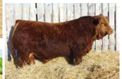
SVS TYCOON 841F