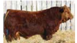
SVS Tycoon 841F - sire