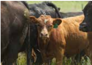
Pheasantdale Shamrock 25N - calf

R PLUS VENOM 4006B MRL MISS 6600D KWA RED ROCK 5T KWA MS BARON 9U WHEATLAND KILL SWITCH WHEATLAND LADY 860F TESS RED EDITION 114T PHEASANTDALE MS 70U