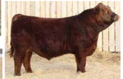
PHEASANTDALE FREEDOM 92F