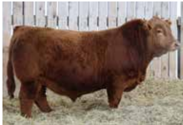
SVS TRIUMPH 81J