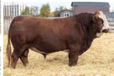
BLACK GOLD KRAKEN 6K