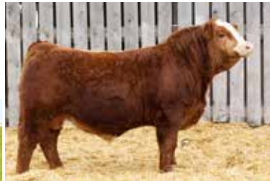
PHEASANTDALE HONKY TONK 8K