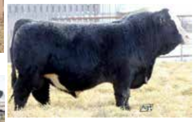
LRX STERLING 46J