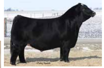
GSC GCCO DEW NORTH 102C