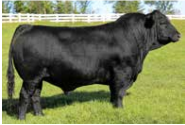
KWA SLIDER 196H