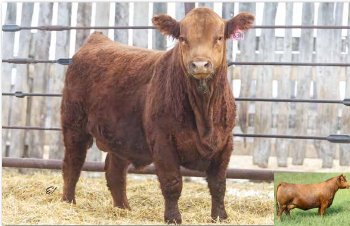
HLTS Sammie - dam

CCLT ALLIANCE 91C WHEATLAND LADY 913W SPRINGCREEK SPARK PLUG BLACKSAND SUE 21A SPRINGCREEK LINER 56U SPRINGCREEK TARA 111R 3D MR RED T-BONE 500U PHEASANTDALE MS EDITH 40X