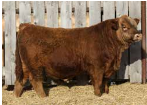
Pheasantdale Mr. Rambler 55J Maternal Sibling