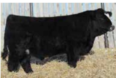
W2 SOUTHSIDE 2K