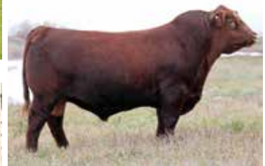
BAILEY'S ONE OF A KIND