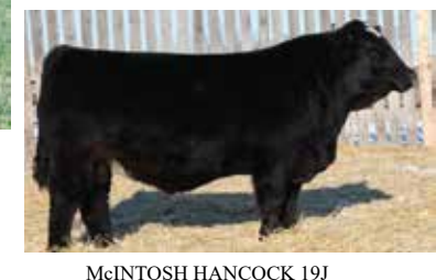
McINTOSH HANCOCK 19J