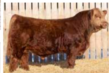
WFL WATER VALLEY 2064K