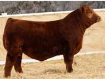
WHEATLAND AFFINITY 8196F