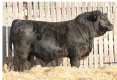
MADER EAGLE 509F