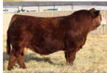
WHEATLAND BULL 11H