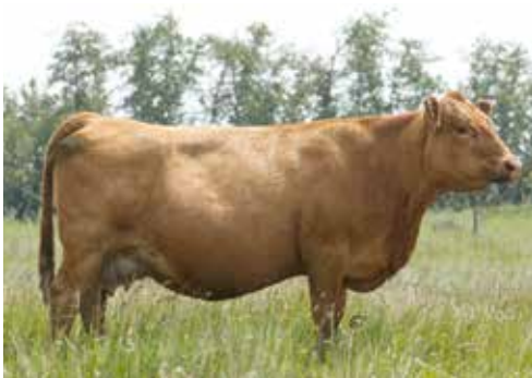
Pheasantdale Fancy 107F - Dam