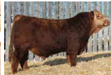
KUNTZ LOUISVILLE 2L