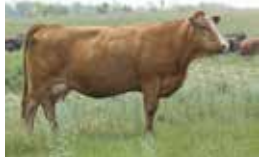
Pheasantdale Lady 115H - dam