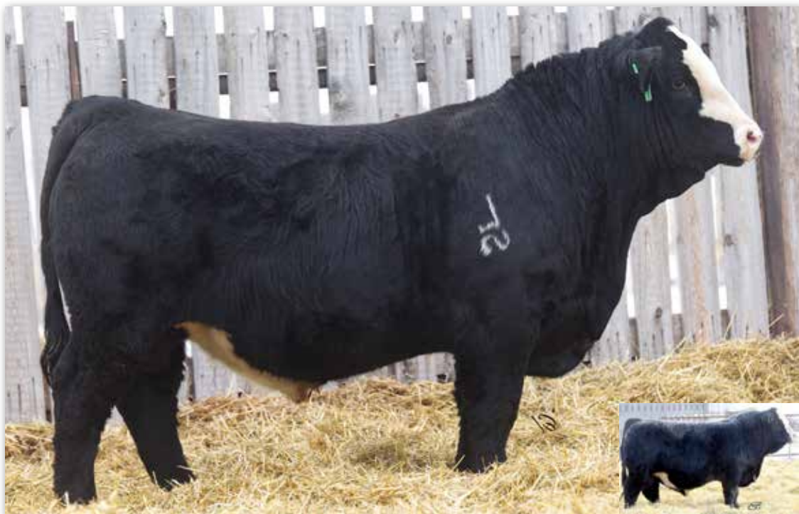
LRX Sterling 46J - sire