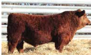
KWA SHAMROCK 151H