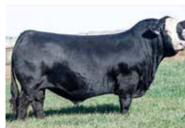
CROSSROAD DATELINE 59L