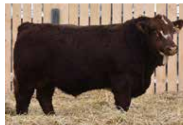
CROSSROADS PILOT 21H