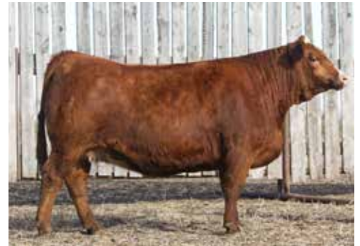
Pheasantdale Ms Tonky 6M Maternal Sibling