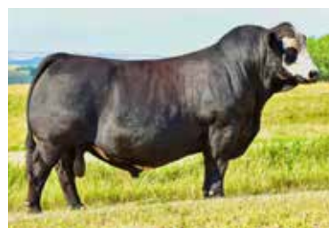
BLACK GOLD AVA'S SCREAM