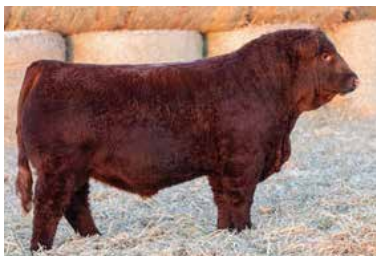
BLACK GOLD MOUNTAIN VIEW 15L