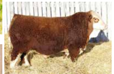
SUNNY VALLEY FREEDOM 22F