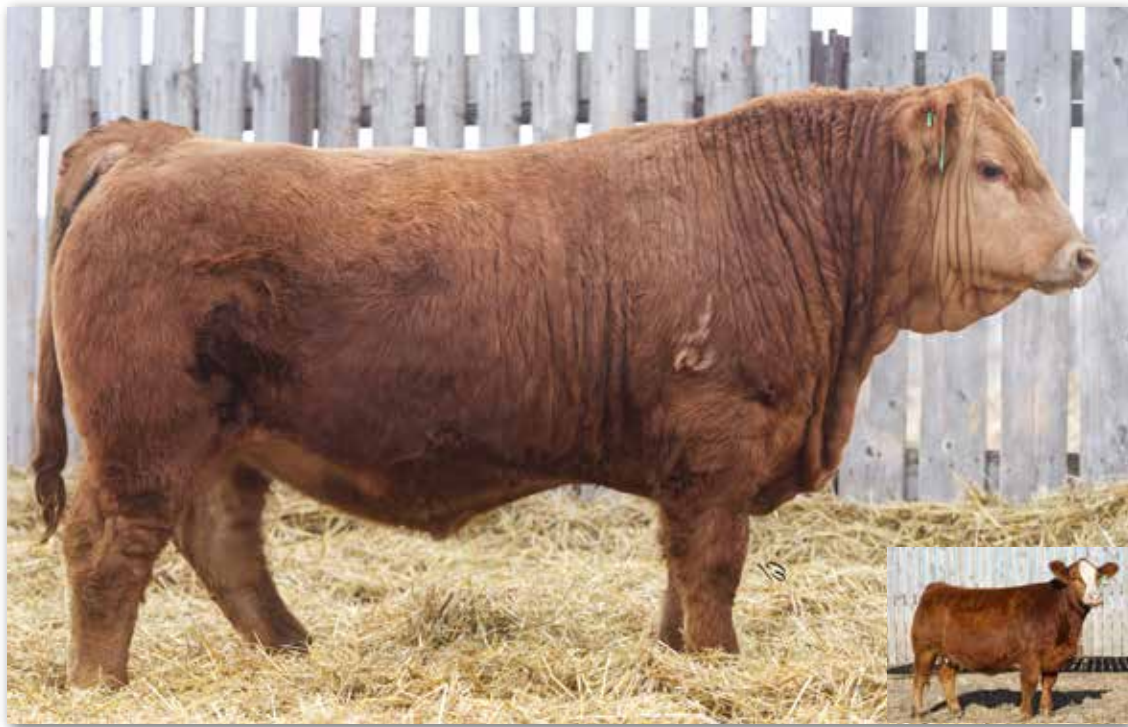
Pheasantdale Ms Tonky 110M- Maternal Sib

These Honky Tonk 8K calves sure have made a stamp in our herd and now they will make theirs in our customers herds as well. Pheasantdale Honky Tonk 46N is a super special bull here for us with his paternal sibling, Pheasantdale Ms Tonky 110M being our high selling female this year at Transcon's 48th Annual Simmsational sale for $16,500 to Jensen Land and Cattle who actually purchased Pheasantdale Honky Tonk 8K from the Double G Simmentals dispersal and she was a part of our Agribition show string. 46N is a medium framed bull that we have to admire for his long body, overall capacity from head to tail an all the way into that lower third. When you get him out on the move you appreciate how he tracks out perfectly and shows that herd bull presence in his front end. His dam is a super stout made Springcreek Blue Chip 9D female with a very well-balanced udder.