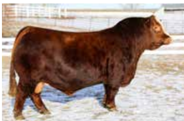
LFE LOYALTY 836H